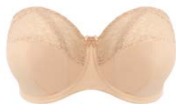
UW STRAPLESS BRA GD6663 ● ●