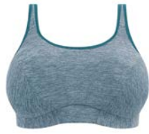
GODDESS SPORT TEAL HEATHER