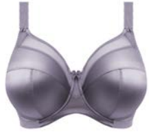
KEIRA BLUE GRANITE