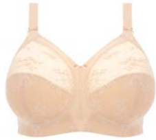
SOFT CUP BRA GD6040 ● ●