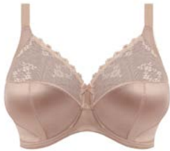
UW BRA GD700105 ● ●