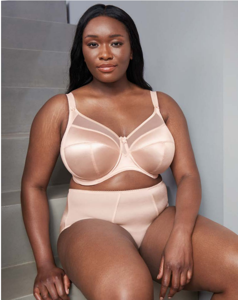
KEIRA GD6090 / GD6095