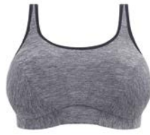
GODDESS SPORT PEWTER HEATHER