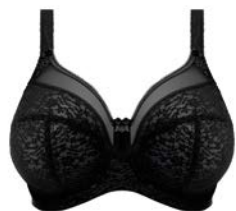
UW BANDED BRA GD6660 ● ●