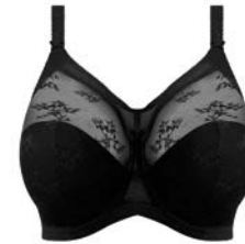
UW FULL CUP BRA GD6041 ● ●