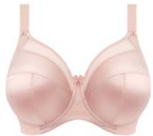
KEIRA PEARL BLUSH