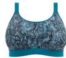
GODDESS SPORT TEAL