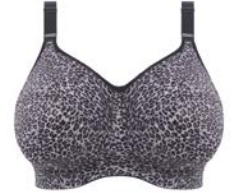
CELESTE GRAY LEOPARD