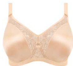
UW MOULDED BRA GD6750 ● ●