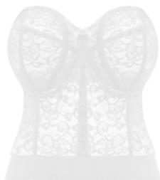
LACE BUSTIER GD0689 ● ●