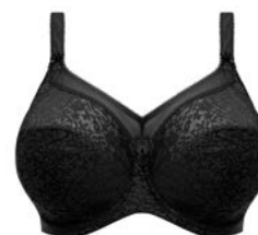
UW FULL CUP BRA GD6661 ● ●