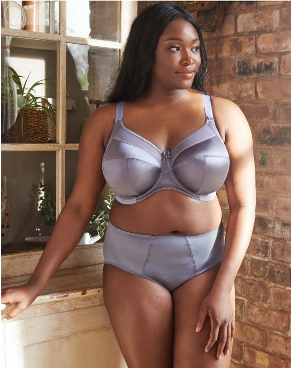
KEIRA GD6090 / GD6095