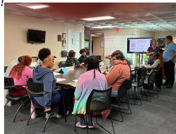
LiftUp classes - students graduate the first semester December 11th