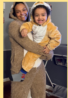
Fun on Halloween Daddy was there too but not in the photo

WAYS for Life is a program like no other and to be a part of this amazing organization is a blessing. WAYS walks alongside the members and helps them achieve their greatest desires: a GED, Career Path, Jobs, Life Skills, Food and Hygiene items and so much more! If you are interested in volunteering, tutoring, mentoring or making a meal, visit WAYSforLife.org .