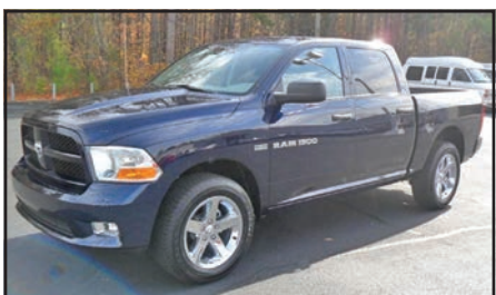
2013 DODGE RAM 4X4 Blue, extra pick truck $17,995 - $4000 DOWN $100 PER WEEK