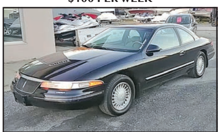
1993 LINCOLN MARK VIII Black, like new, 42,000 miles $7995 - $2000 DOWN $75 PER WEEK