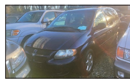
2005 DODGE GRAND CARVAN Blue, runs good $3995 - $1000 DOWN $50 PER WEEK