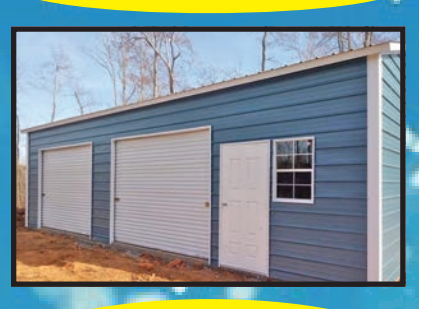
All Buildings over 30' in length we highly recommend vertical roofing