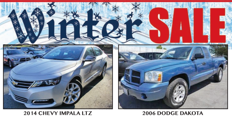
2014 CHEVY IMPALA LTZ Silver, leather, automatic, air, fully loaded, sunroof, extra nice

1968 FORD F-100: has 1978 Cobra Mustang engine, automatic, runs and drives great, $12,500 obo. Call 864-838-1923. (01/02)