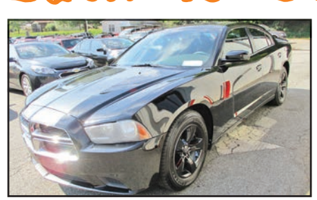
2014 DODGE CHARGER Black, V-6, automatic, air, alloy wheels, all power, back-up camera, extra sharp $13.995 - $3500 DOWN $100 PER WEEK