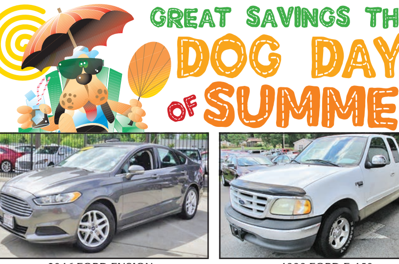
2016 FORD FUSION Gray, 84,000 miles, extra nice 14,995 - $4000 DOWN $100 PER WEEK