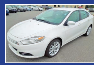
2013 DODGE DART