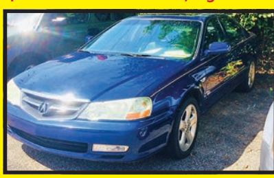
2002 ACURA 3.2 TL $855 DOWN Includes