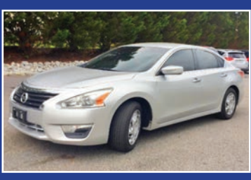
2013 NISSAN ALTIMA