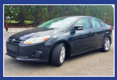
2014 FORD FOCUS SE