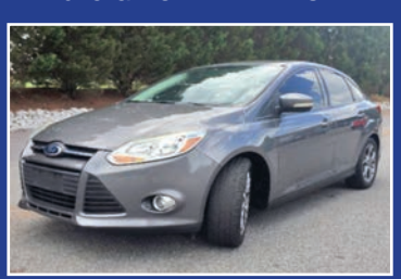
2013 FORD FOCUS SE