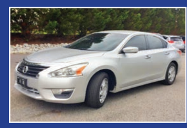
2013 NISSAN ALTIMA