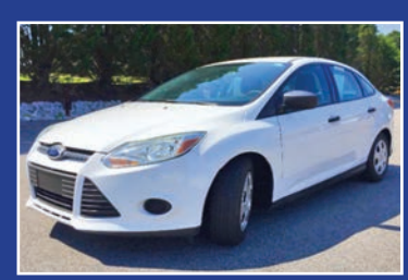
2014 FORD FOCUS S