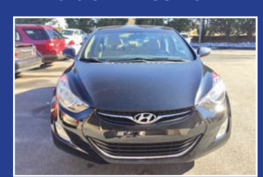
2013 HYUNDAI ELANTRA GLS