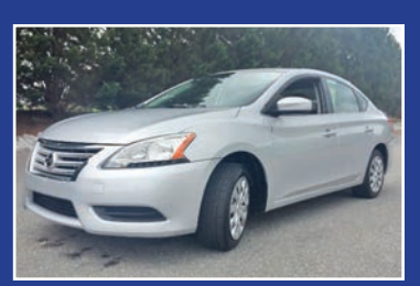
2013 NISSAN SENTRA SV