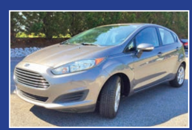
2014 FORD FIESTA SE