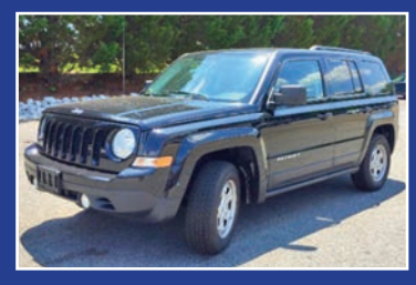
2014 JEEP PATRIOT SPORT

View Our Inventory & Get Approved Now www.acdrivenow.com