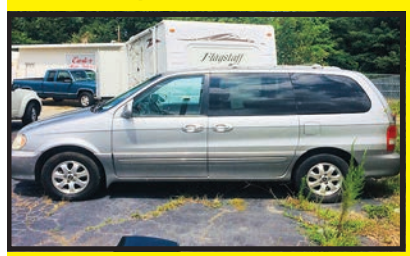
2005 KIA SEDONA