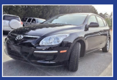
2011 HYUNDAI ELANTRA GLS