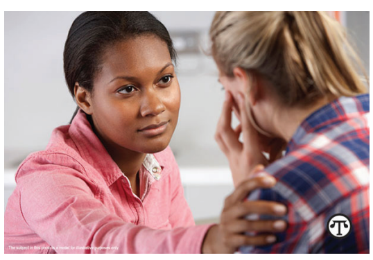
Treating addiction doesn't have to be something you do alone.

1. Accreditation: Make sure the treatment program is licensed or certified by the state. This ensures the provider meets basic quality and safety requirements. You should also check that the program is accredited, which means it meets standards of care set by a national, compliance organization. Be sure to ask the program to show you how people using their services have rated them.