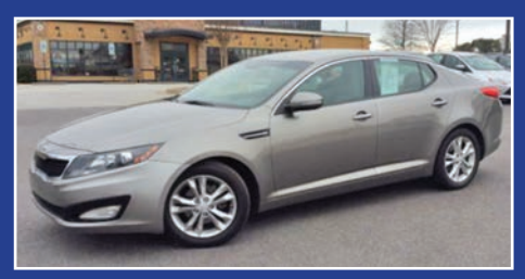
2013 KIA OPTIMA LX