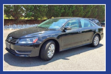
2012 VW PASSAT