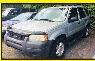
2004 FORD ESCAPE