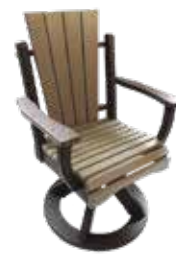
Daisy Square Swivel Dining Chair #QASD - 22 26" W x 26" D x 37" H Seat - 17 1/2" H (40 lbs.)