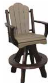
Daisy Arm Swivel Bar Chair #DASB - 24 26" W x 28" D x 49" H Seat - 29 1/2" H (61 lbs.)

OUR SWIVELS ARE MANUFACTURED IN THE USA!