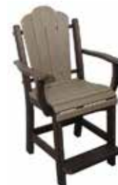
Daisy Arm Counter Chair #DAC - 17 26" W x 24" D x 43" H Seat - 23 1/2" (33 lbs.)