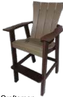
Craftsman Bar Chair #QBB - 21 28" W x 30" D x 50" H Seat - 29 3/4" H (47 lbs.)