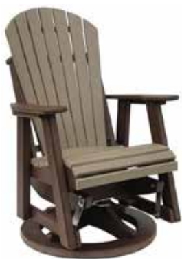
Comfy-Back Swivel Glider #CBSG - 46 29" W x 32" D x 43" H Seat - 17 1/2" H (76 lbs.)