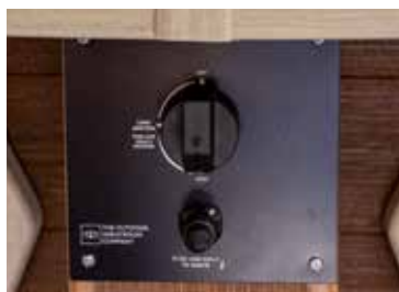
Ignition and Flame Controller

Glass wind guard and clear fire gems are standard on all fire tables