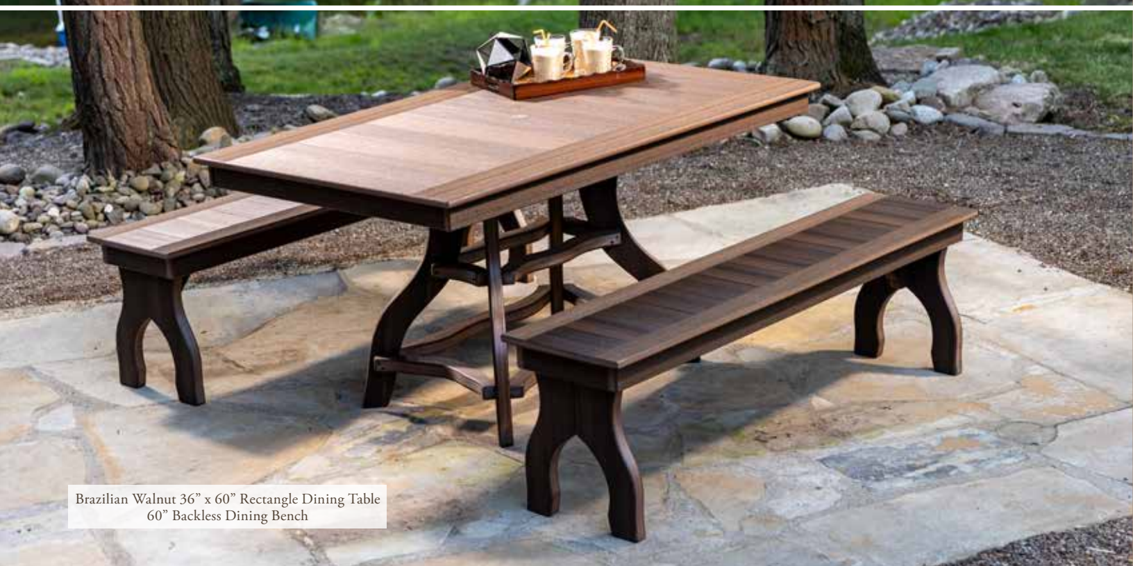
Brazilian Walnut 36" x 60" Rectangle Dining Table 60" Backless Dining Bench