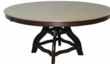
60" Round Dining Table #60-RTD • 29.5" H - (120 lbs.)