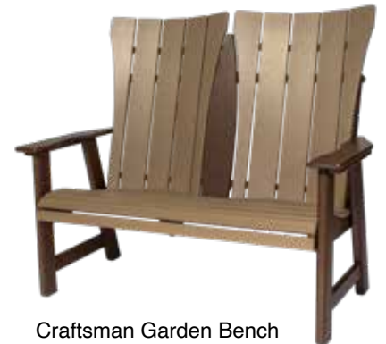
Craftsman Garden Bench #QBG - 8 54" W x 27" D x 44" H Seat - 17 1/2" H (75 lbs.)