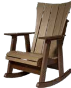
Craftsman Rocker #QBR - 47 29" W x 32" D x 42" H Seat - 17 1/2" H (48 lbs.)