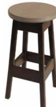
Patio Bar Stool #PSB - 41 15" W x 30" H - (22 lbs.)