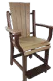
Daisy Square Arm Counter Chair #QAC - 17 26" W x 24" D x 43" H Seat - 23 1/2" (33 lbs.)