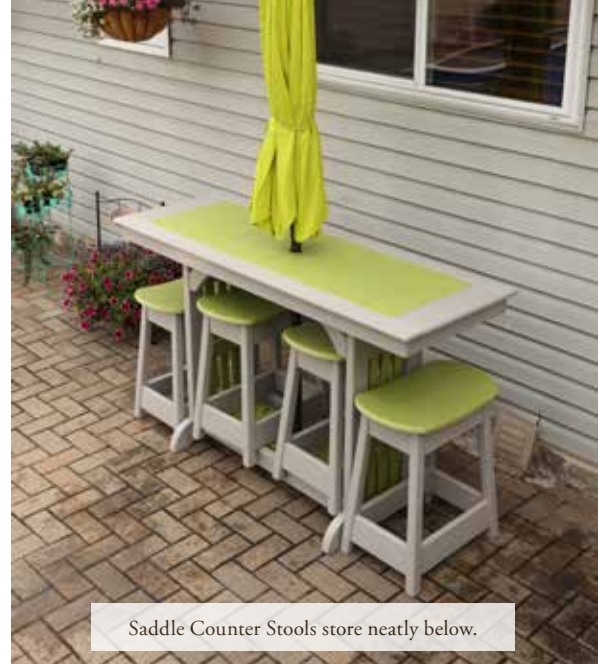
Saddle Counter Stools store neatly below.