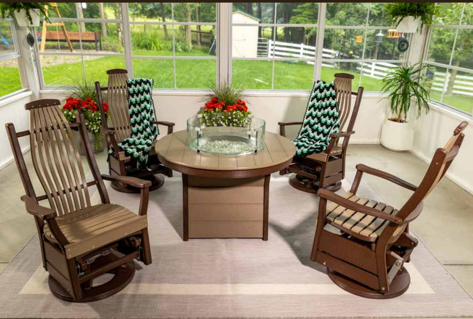
Weathered Wood on Brown Woodland Swivel Gliders 44" Round Dining Fire Table

UNIQUELY OURS. . . A MASTERPIECE OF COMFORT AND QUALITY