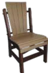
Daisy Square Side Dining Chair #QSD - 13 19" W x 20" D x 37" H Seat - 17 1/2" H (26 lbs.)