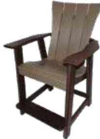
Craftsman Counter Chair #QBC - 20 28" W x 30" D x 44" H Seat - 23 3/4" H (45 lbs.)