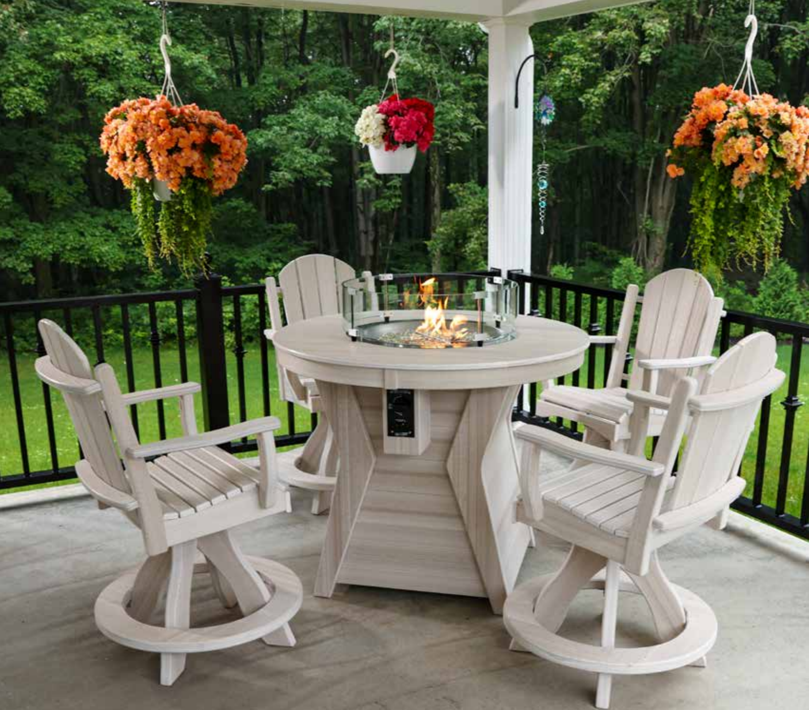
Seashell 44" Round Counter Fire Table with Daisy Comfy Swivel Counter Chairs