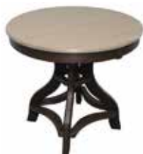
32" Round Dining Table #32-RTD • 29.5" H - (50 lbs.)