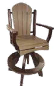
Daisy Comfy Swivel Bar Chair #DCSWB - 24 26" W x 28" D x 49" H Seat - 29 1/2" (61 lbs.)