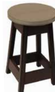
Patio Counter Stool #PSC - 40 15" W x 24" H - (21 lbs.)