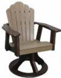
Snuggle-Back Swivel Dining Chair #SBSD - 39 28" W x 26" D x 37" H Seat - 17 1/2" H (40 lbs.)