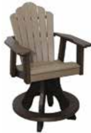
Snuggle-Back Swivel Counter Chair #SBSC - 40 28" W x 30" D x 44" H Seat - 23 3/4" H (59 lbs.)