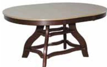
44" x 60" Oval Dining Table #44x60-OTD • 29.5" H - (108 lbs.)