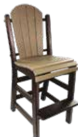
Daisy Comfy Side Bar Chair #DCSB - 15 19" W x 25" D x 49" H Seat - 29 1/2" (35 lbs.)