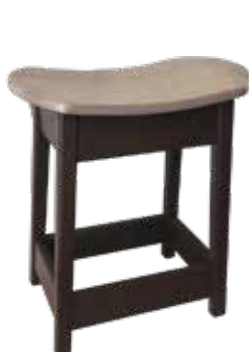
Counter Saddle Stool #SCS-48 20" W x 23" H x 12" D - (19 lbs.)