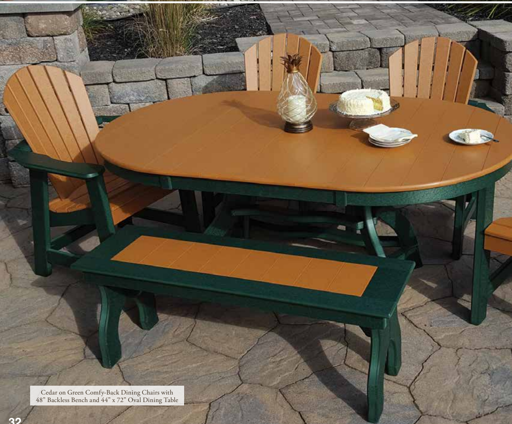
Cedar on Green Comfy-Back Dining Chairs with 48" Backless Bench and 44" x 72" Oval Dining Table