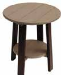
Round Dining End Table #RETD - 42 21" W x 22" H - (17 lbs.)