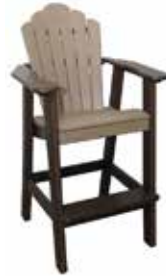
Snuggle-Back Bar Chair #SBB - 21 28" W x 30" D x 50" H Seat - 29 3/4" H (47 lbs.)