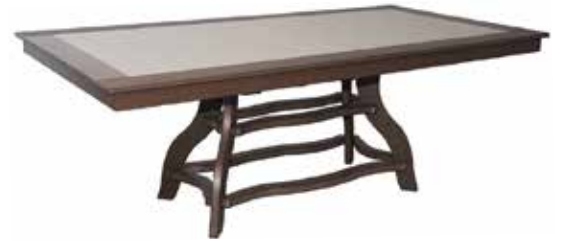
44" x 84" Rectangular Dining Table #44x84-RTD • 29.5" H - (165 lbs.)