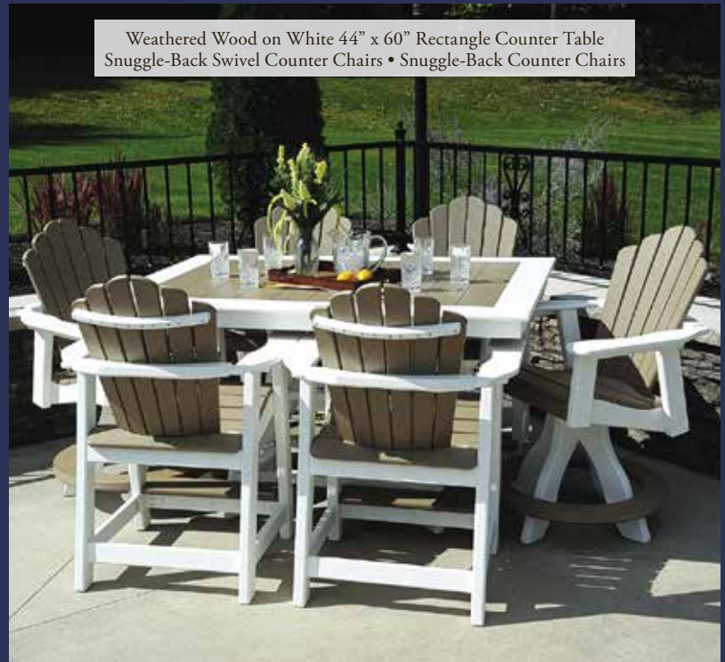
Weathered Wood on White 44" x 60" Rectangle Counter Table Snuggle-Back Swivel Counter Chairs • Snuggle-Back Counter Chairs