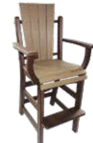
Daisy Square Arm Bar Chair #QAB - 18 26" W x 25" D x 49" H Seat - 29 1/2" (39 lbs.)