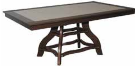
44" x 72" Rectangular Dining Table #44x72-RTD • 29.5" H - (146 lbs.)