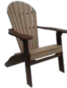
Comfy-Back Folding Adirondack Chair #CFA - 45 31" W x 31" D x 41" H Seat - 16" H (41 lbs.)