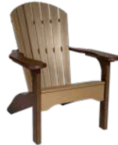
Comfy-Back Adirondack Chair #CA - 7 31" W x 31" D x 40" H Seat - 16" H (40 lbs.)