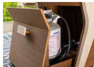
Propane Tank Drawer