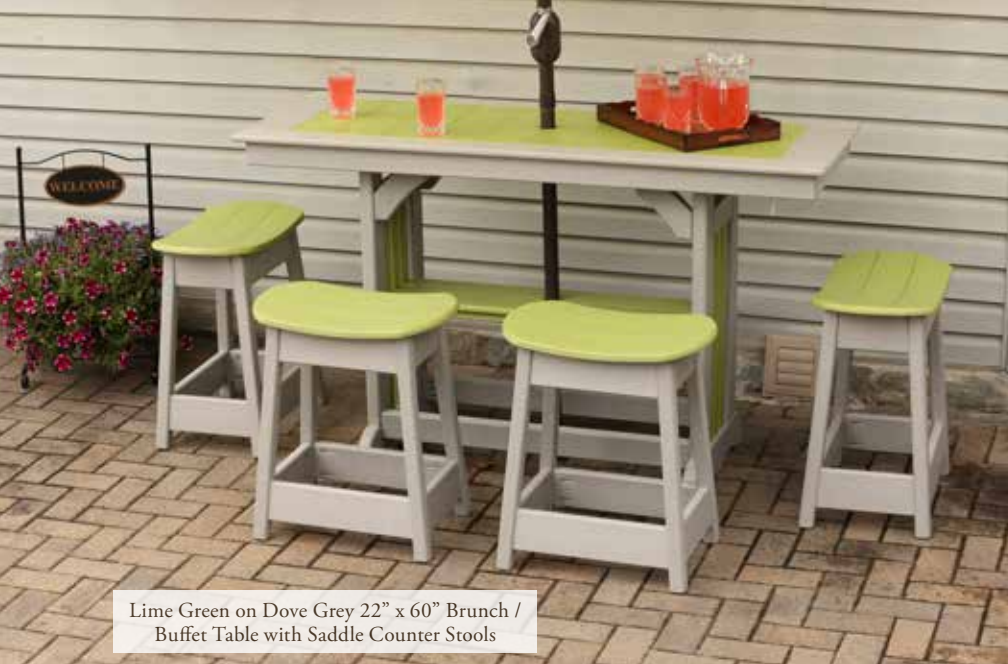
Lime Green on Dove Grey 22" x 60" Brunch / Buffer Table with Saddle Counter Stools