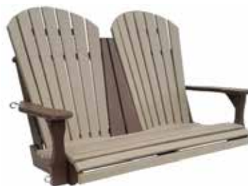
Comfy-Back Swing 4' * #CS4 - 9 53" W x 28" D x 30" H (64 lbs.)