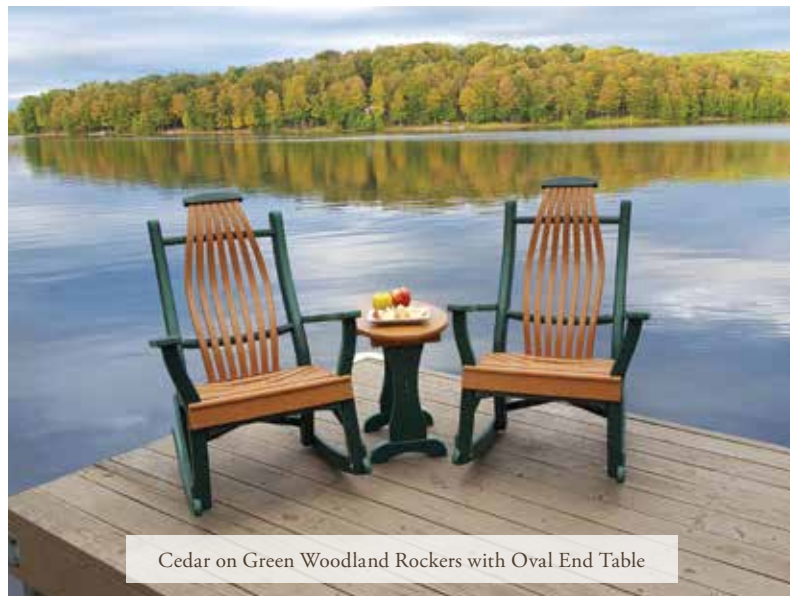
Cedar on Green Woodland Rockers with Oval End Table