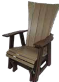
Craftsman Single Glider #QSG - 6 29" W x 31" D x 41" H Seat - 17" H (57 lbs.)