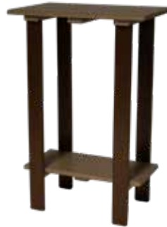
Rectangle Bar Table #QETB - 44 22" W x 15" D x 34" H - (21 lbs.)