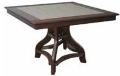
44" Square Dining Table #44-STD • 29.5" H - (95 lbs.)