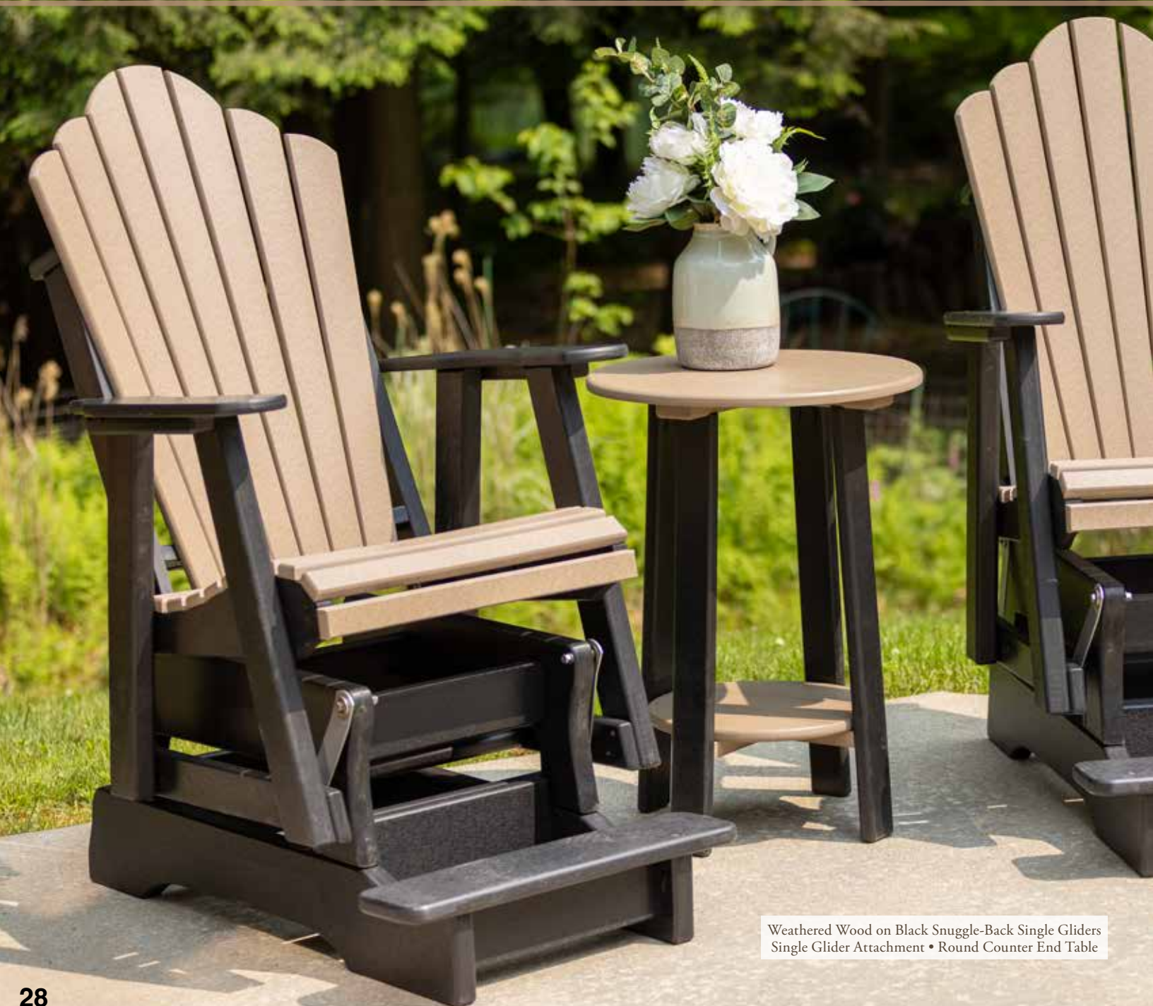
Weathered Wood on Black Snuggle-Back Single Gliders Single Glider Attachment • Round Counter End Table