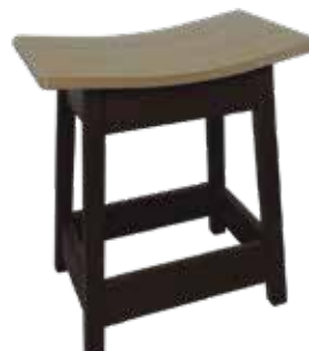
Counter Square Saddle Stool #QCS-48 20" W x 23" H x 12" D - (19 lbs.)