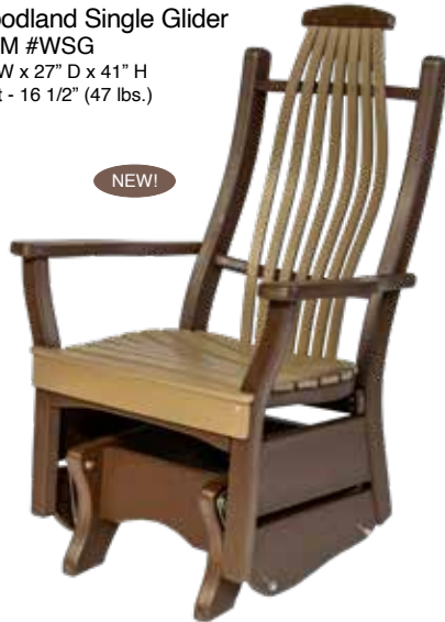
Woodland Single Glider ITEM #WSG 26" W x 27" D x 41" H Seat - 16 1/2" (47 lbs.)