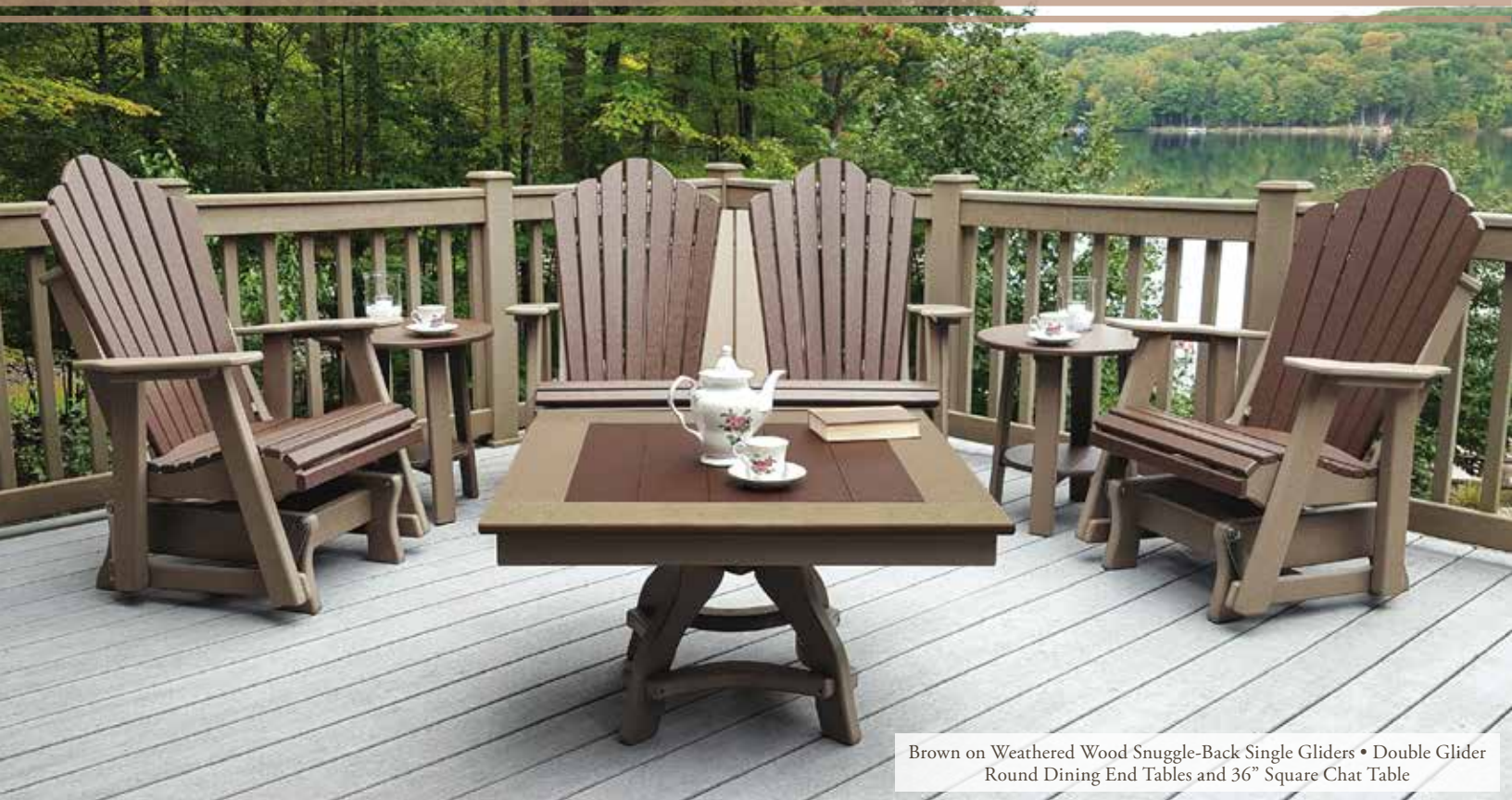
Brown on Weathered Wood Snuggle-Back Single Gliders • Double Glider Round Dining End Tables and 36" Square Chat Table