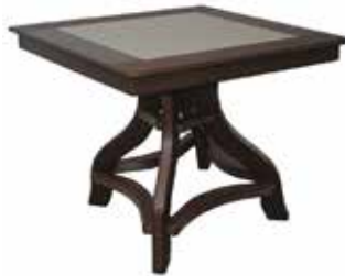
36" Square Dining Table #36-STD • 29.5" H - (71 lbs.)