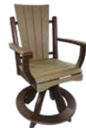
Daisy Square Swivel Counter Chair #QASC - 23 26" W x 30" D x 43" H Seat - 23 3/4" (59 lbs.)