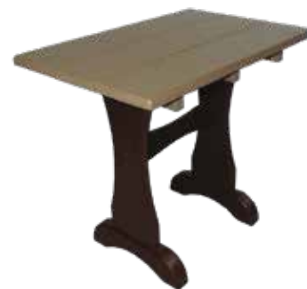
Square End Table #QET - 2 22" W x 15" D x 20" H - (14 lbs.)