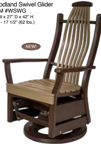
Woodland Swivel Glider ITEM #WSWG 26" W x 27" D x 42" H Seat - 17 1/2" (62 lbs.)