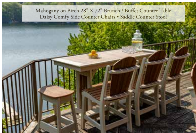
Mahogany on Birch 28" X 72" Brunch / Buffet Counter Table Daisy Comfy Side Counter Chairs • Saddle Counter Stool