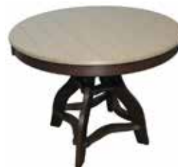
44" Round Dining Table #44-RTD • 29.5" H - (76 lbs.)