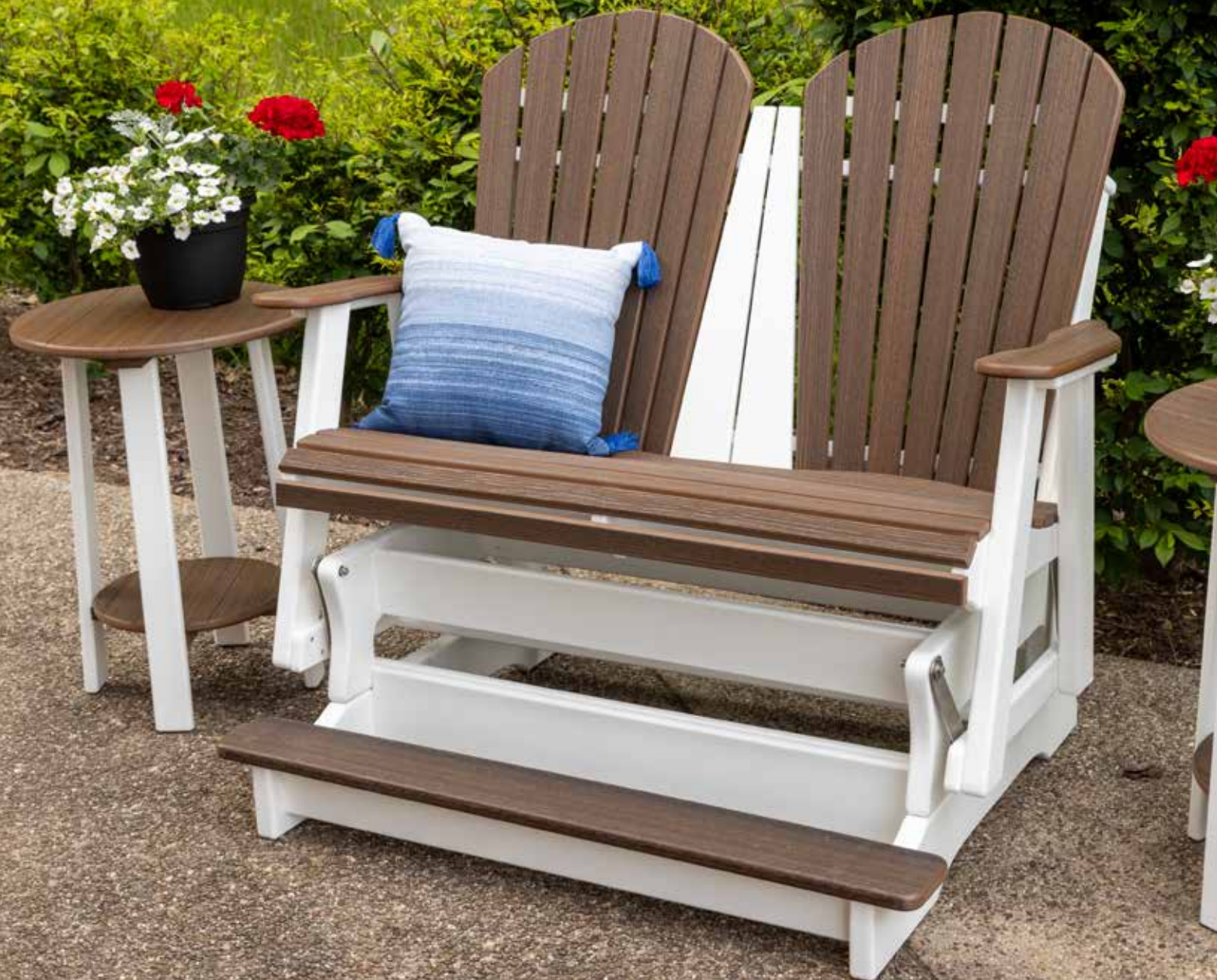
Brazilian Walnut on White Comfy-Back Double Glider Double Glider Attachment • Round Counter End Tables