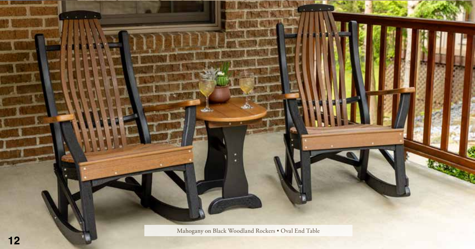
Mahogany on Black Woodland Rockers • Oval End Table