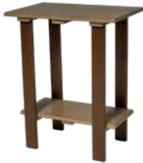
Rectangle Counter Table #QETC - 43 22" W x 15" D x 28" H - (19 lbs.)