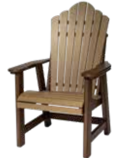
Snuggle-Back Garden Chair #SGC 29" W x 30" D x 44" H Seat - 17" H (42 lbs.)

Our Swivels are Manufactured in the U.S.A.!