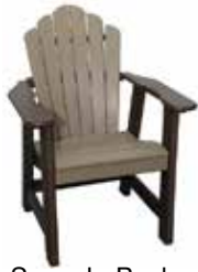
Snuggle-Back Dining Chair #SBD - 19 28" W x 28" D x 37" H Seat - 17 3/4" H (37 lbs.)