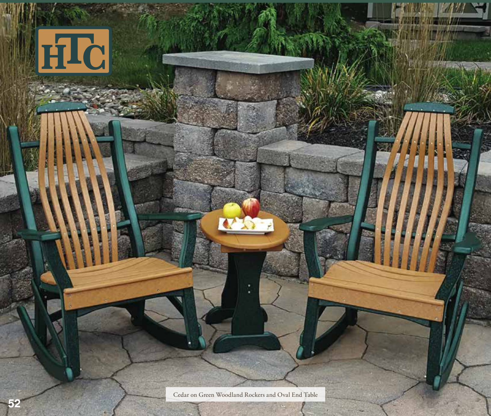
Cedar on Green Woodland Rockers and Oval End Table