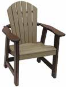
Comfy-Back Dining Chair #CBD - 19 28" W x 28" D x 37" H Seat - 17 1/2" H (37 lbs.)