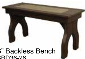
36" Backless Bench #BBD36-26 14" D x 36" W • (Approx. 32 - 35 lbs.)