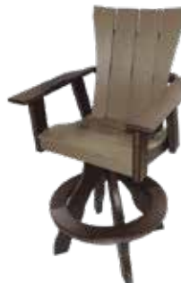
Craftsman Swivel Bar Chair #QBSB - 41 28" W x 30" D x 50" H Seat - 29 3/4" H (61 lbs.)