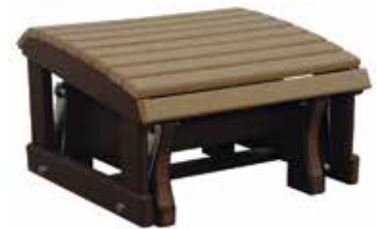
Gliding Ottoman #GO - 32 19" W x 19" D x 14" H - (23 lbs.)