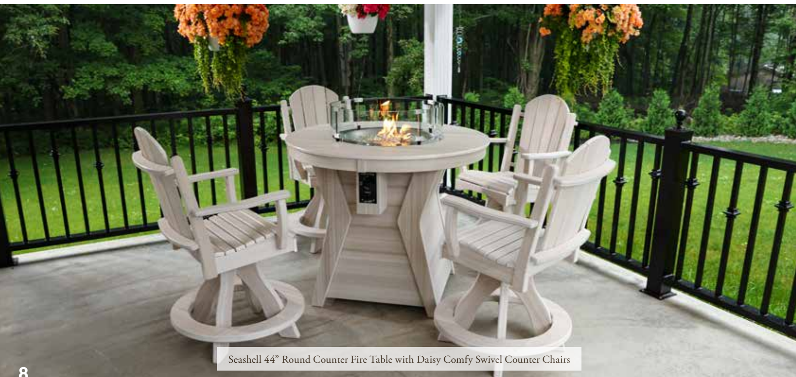
Seashell 44" Round Counter Fire Table with Daisy Comfy Swivel Counter Chairs