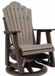
Snuggle-Back Swivel Glider #SBSEG - 46 29" W x 32" D x 43" H Seat - 17 1/2" H (76 lbs.)