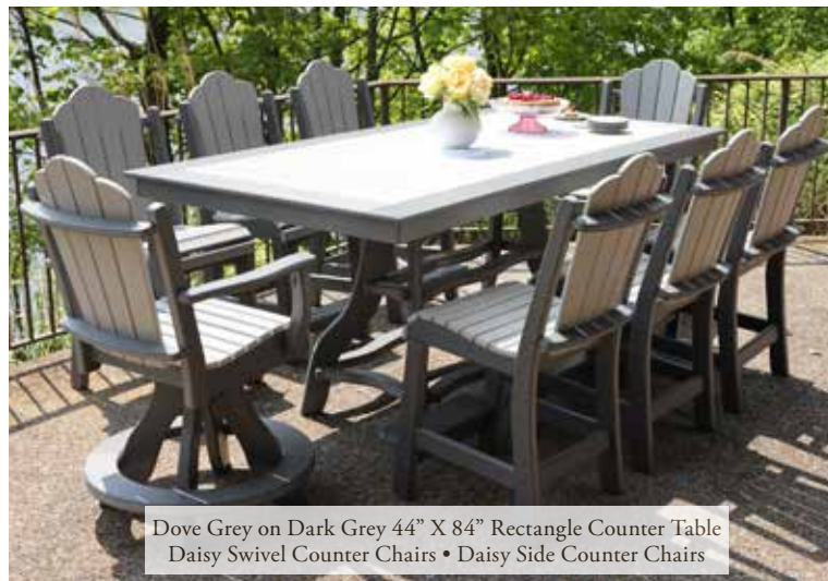
Dove Grey on Dark Grey 44" X 84" Rectangle Counter Table Daisy Swivel Counter Chairs • Daisy Side Counter Chairs