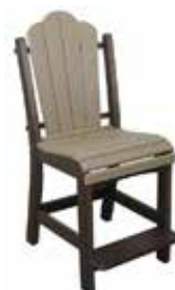
Daisy Side Counter Chair #DSC - 14 19" W x 24" D x 43" H Seat - 23 1/2" (29 lbs.)