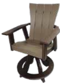
Craftsman Swivel Counter Chair #QBSC - 40 28" W x 30" D x 44" H Seat - 23 3/4" H (59 lbs.)