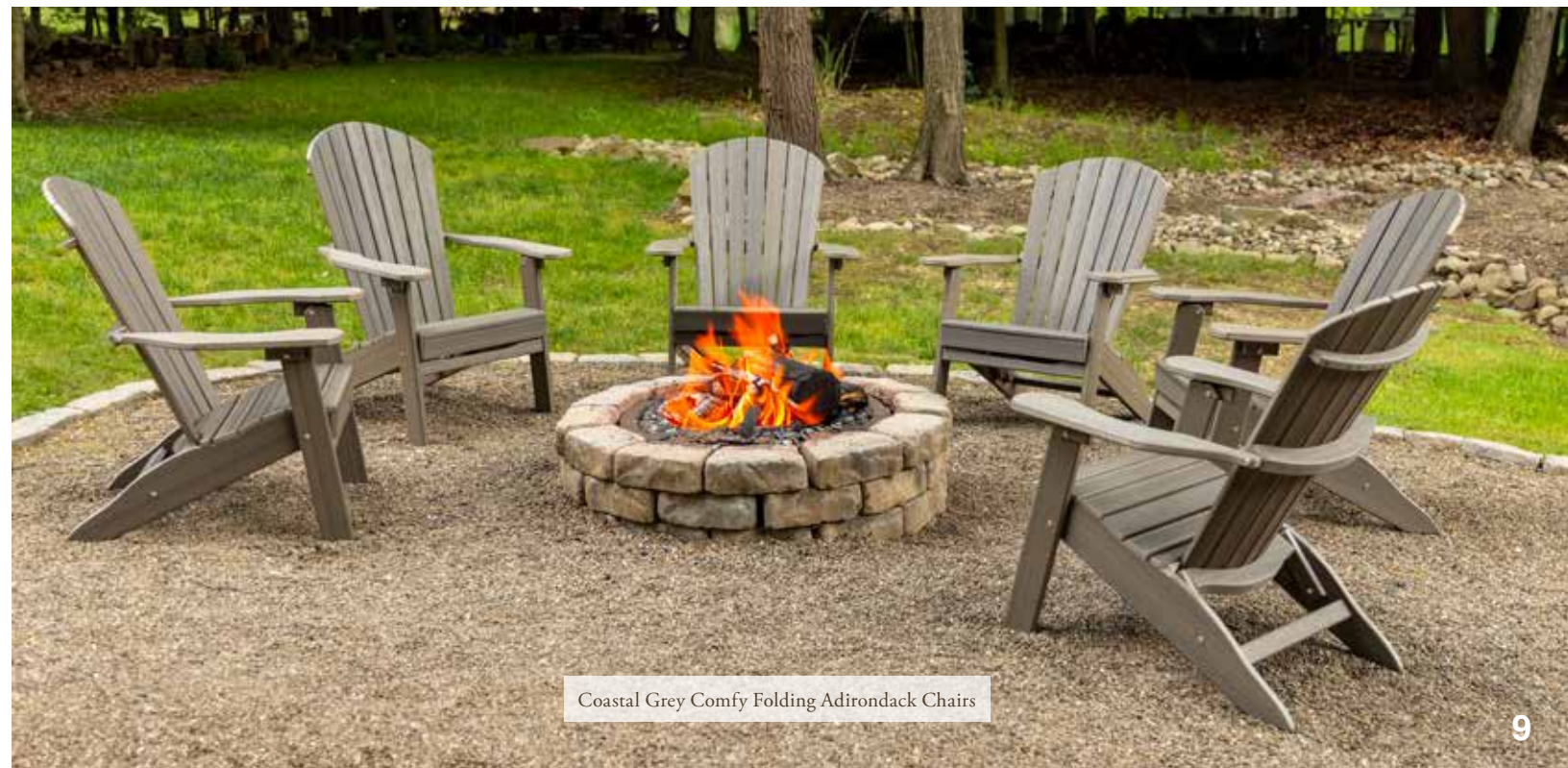
Coastal Grey Comfy Folding Adirondack Chairs