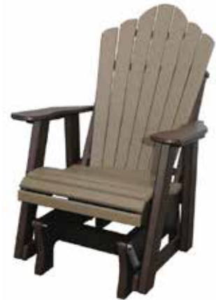
Snuggle-Back Single Glider

You'll see a very minimal amount of exposed hardware in our designs. In our Daisy Collections, Snuggle-Back Collection, Comfy-Back Collection, and Craftsman Collection most of the screws & bolts are hidden, which is vastly different from what you will see in most of our competitor's products.