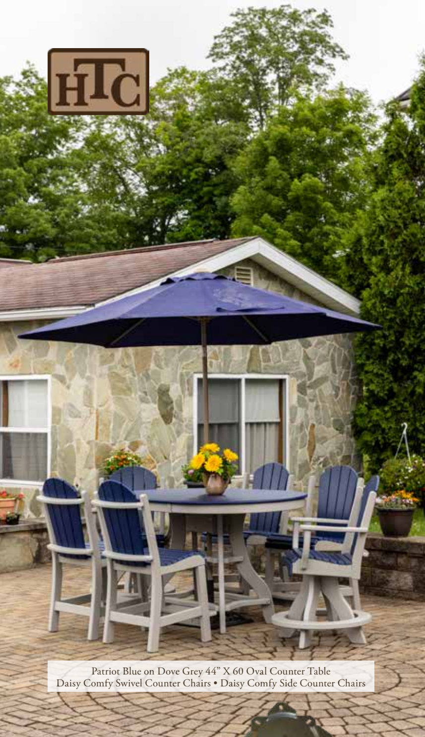
Patriot Blue on Dove Grey 44" X 60 Oval Counter Table Daisy Comfy Swivel Counter Chairs • Daisy Comfy Side Counter Chairs