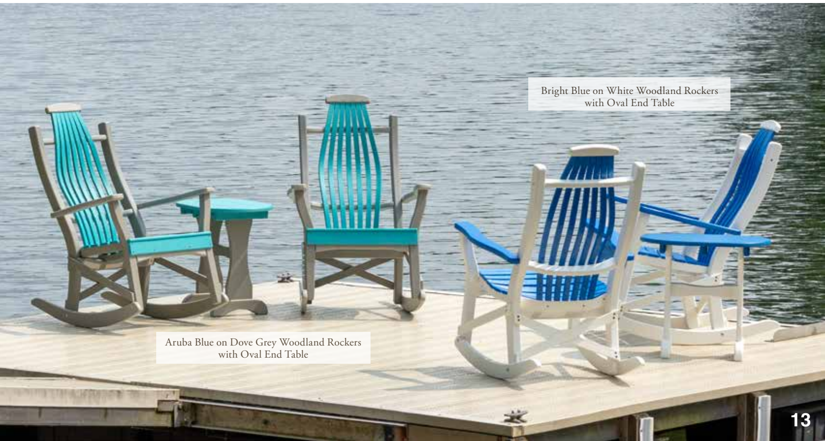
Bright Blue on White Woodland Rockers with Oval End Table