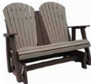
Comfy-Back Double Glider #CDG - 5 54" W x 31" D x 41" H Seat - 17" H (90 lbs.)