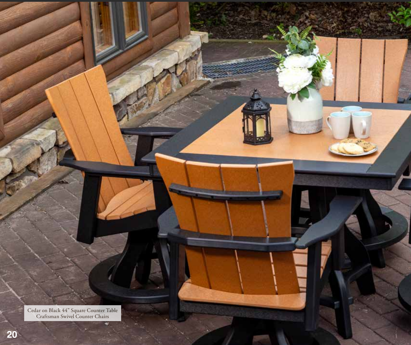
Cedar on Black 44" Square Counter Table Craftsman Swivel Counter Chairs

A SUPERBLY CRAFTED HTC CONTEMPORARY DESIGN