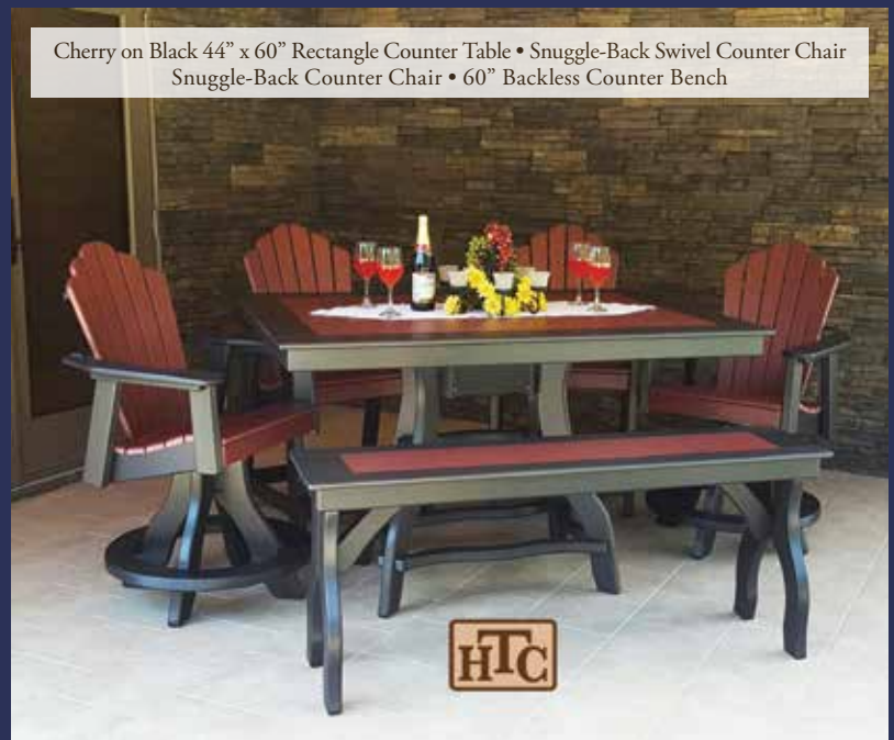
Cherry on Black 44" x 60" Rectangle Counter Table • Snuggle-Back Swivel Counter Chair Snuggle-Back Counter Chair • 60" Backless Counter Bench