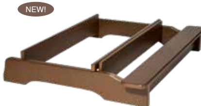
Double Glider Attachment #DGA 47" W x 37" D x 8" H - (33 lbs.)