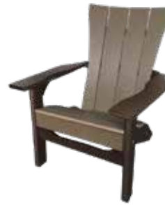
Craftsman Folding Adirondack Chair #QFA-45 31" W x 31" D x 41" H Seat - 16" H (41 lbs.)