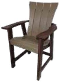
Craftsman Dining Chair #QBD - 19 28" W x 28" D x 37" H Seat - 17 3/4" H (37 lbs.)