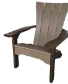
Craftsman Adirondack Chair #QA-7 31" W x 31" D x 40" H Seat - 16" H (40 lbs.)