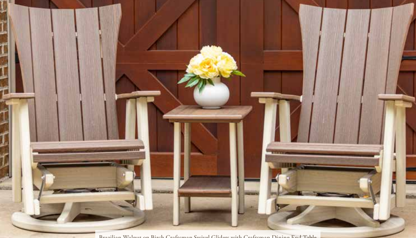
Brazilian Walnut on Birch Craftsman Swivel Gliders with Craftsman Dining End Table