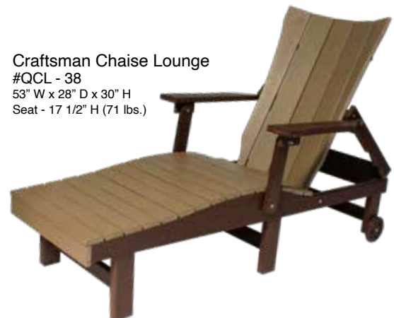
Craftsman Chaise Lounge #QCL - 38 53" W x 28" D x 30" H Seat - 17 1/2" H (71 lbs.)