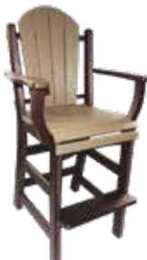
Daisy Comfy Arm Bar Chair #DCAB - 18 26" W x 25" D x 49" H Seat - 29 1/2" (39 lbs.)