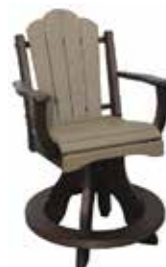
Daisy Arm Swivel Counter Chair #DASC - 23 26" W x 39" D x 43" H Seat - 23 3/4" H (59 lbs.)