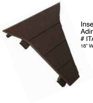
Insert Table for Adirondack Chair #ITA - 36 18" W x 20" D - (6 lbs.)