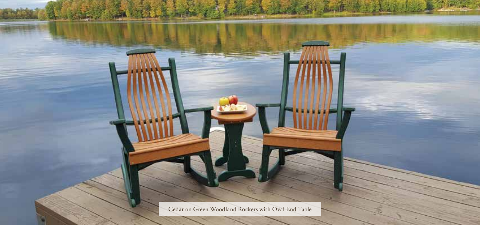
Cedar on Green Woodland Rockers with Oval End Table