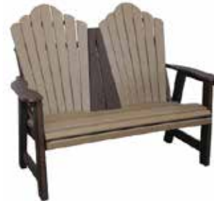
Snuggle-Back Garden Bench #SGB - 8 54" W x 27" D x 40" H Seat - 17" H (68 lbs.)