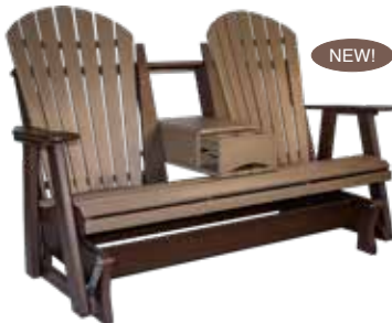
Comfy-Back 5' Glider with Console #CG5C 65" W x 33" D x 42" H Seat - 17" H (135 lbs.)

Our Swivels are Manufactured in the U.S.A.!