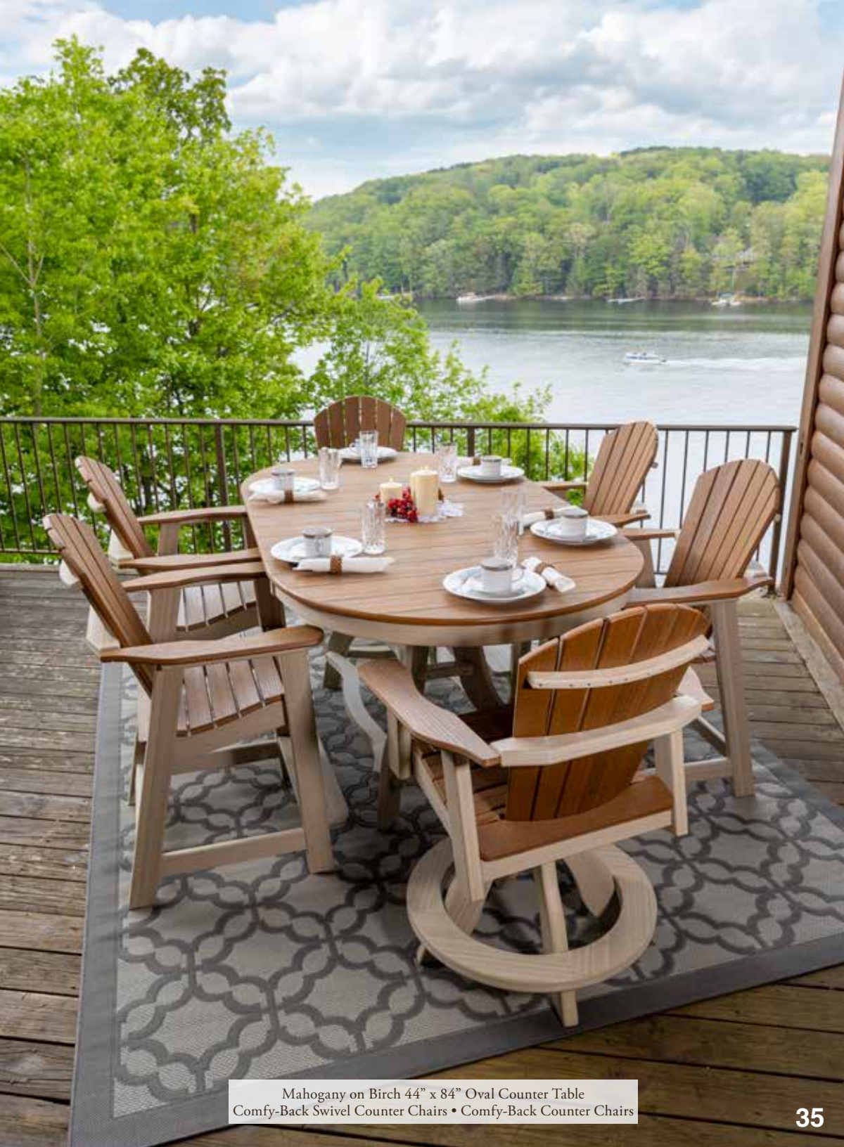
Mahogany on Birch 44" x 84" Oval Counter Table Comfy-Back Swivel Counter Chairs • Comfy-Back Counter Chairs