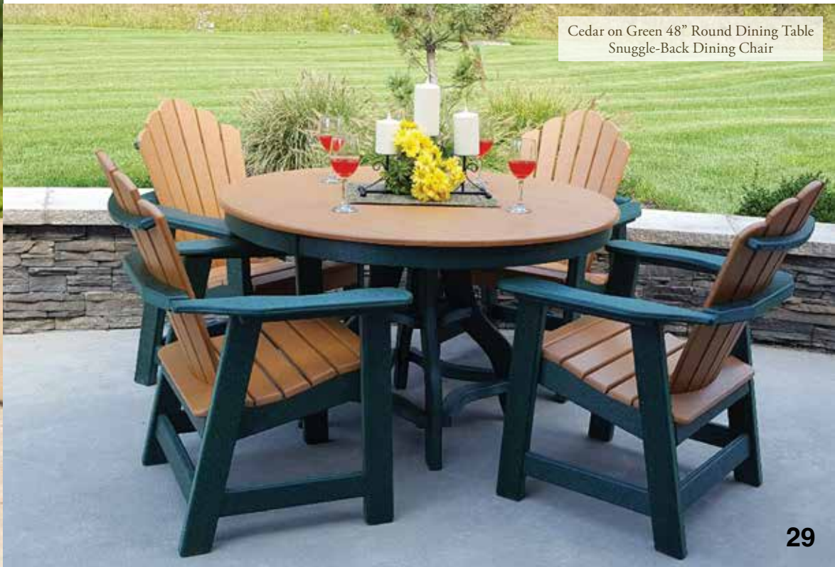
Cedar on Green 48" Round Dining Table Snuggle-Back Dining Chair