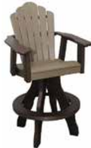
Snuggle-Back Swivel Bar Chair #SBSB - 41 28" W x 30" D x 50" H Seat - 29 3/4" H (61 lbs.)