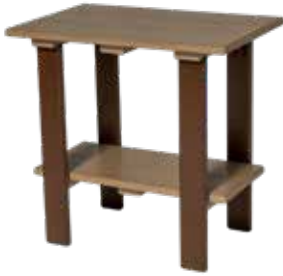
Rectangle Dining End Table #QEDT - 42 23" W x 15" D x 22" H - (17 lbs.)