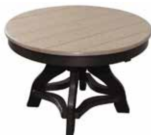
32" Round Chat Table #32-RCT • 18" H - (46 lbs.)