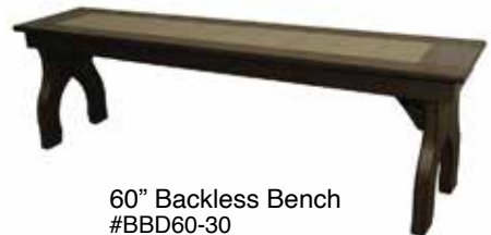
60" Backless Bench #BBD60-30 14" D x 60" W • (Approx. 46 - 49 lbs.)