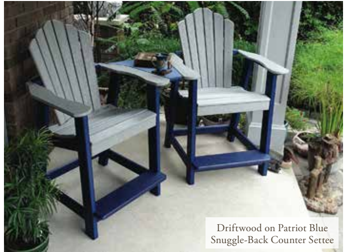
Driftwood on Patriot Blue Snuggle-Back Counter Settee