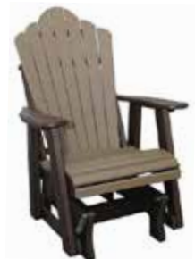
Snuggle-Back Single Glider #SSG - 6 29" W x 31" D x 41" H Seat - 17" H (57 lbs.)