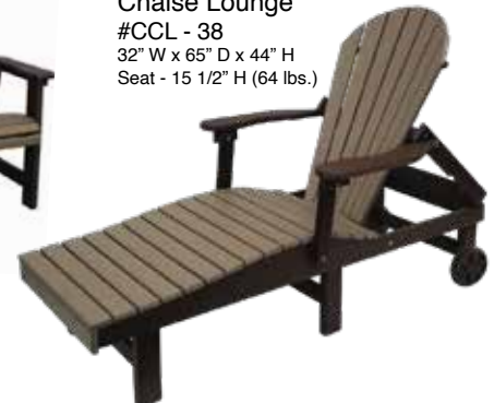
Comfy-Back Chaise Lounge #CCL - 38 32" W x 65" D x 44" H Seat - 15 1/2" H (64 lbs.)