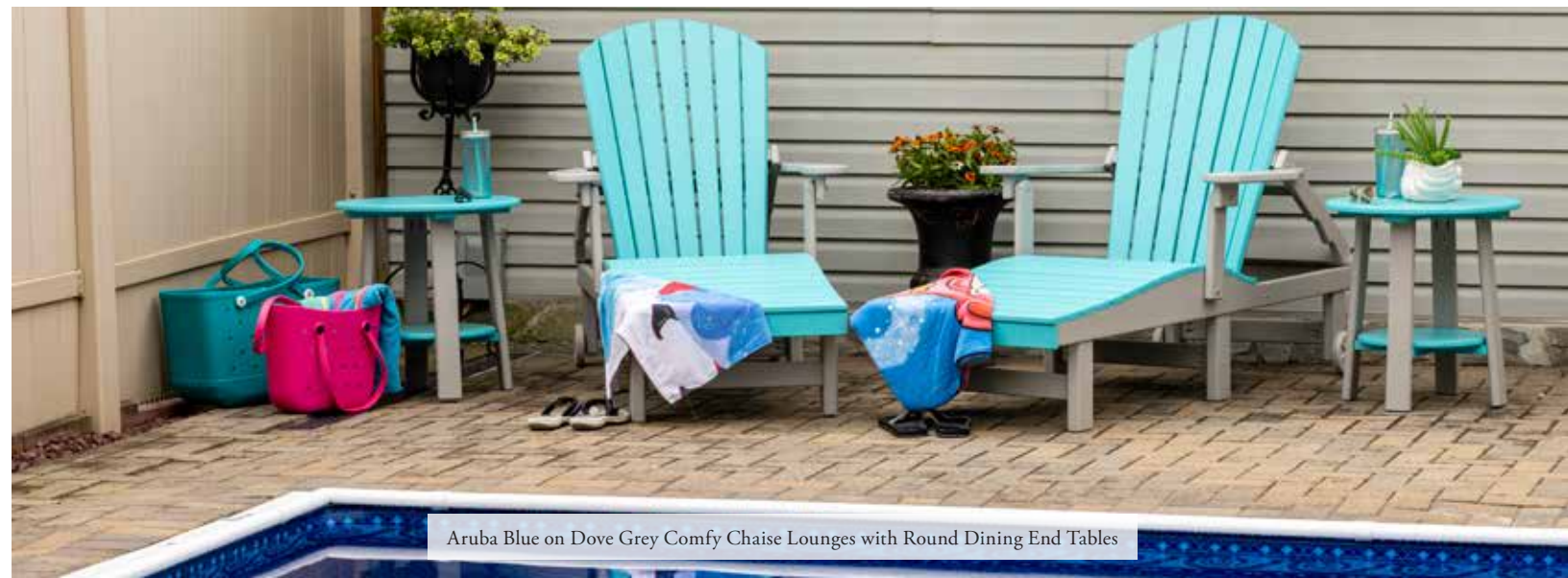
Aruba Blue on Dove Grey Comfy Chaise Lounges with Round Dining End Tables