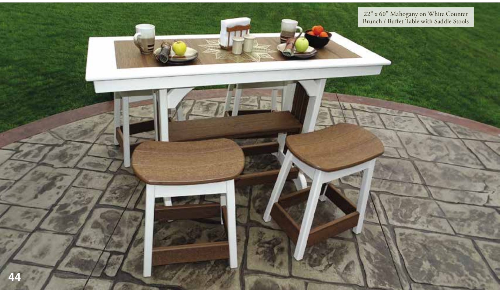
22" x 60" Mahogany on White Counter Brunch / Buffer Table with Saddle Stools