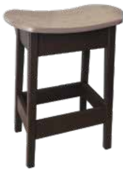
Bar Saddle Stool #SBS - 49 20" W x 29" H x 12" D - (21 lbs.)