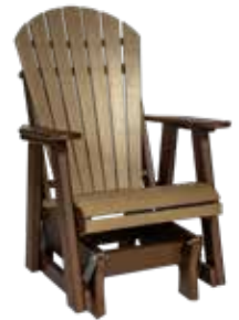
Comfy-Back Single Glider #CSG - 6 29" W x 31" D x 41" H Seat - 17" H (57 lbs.)