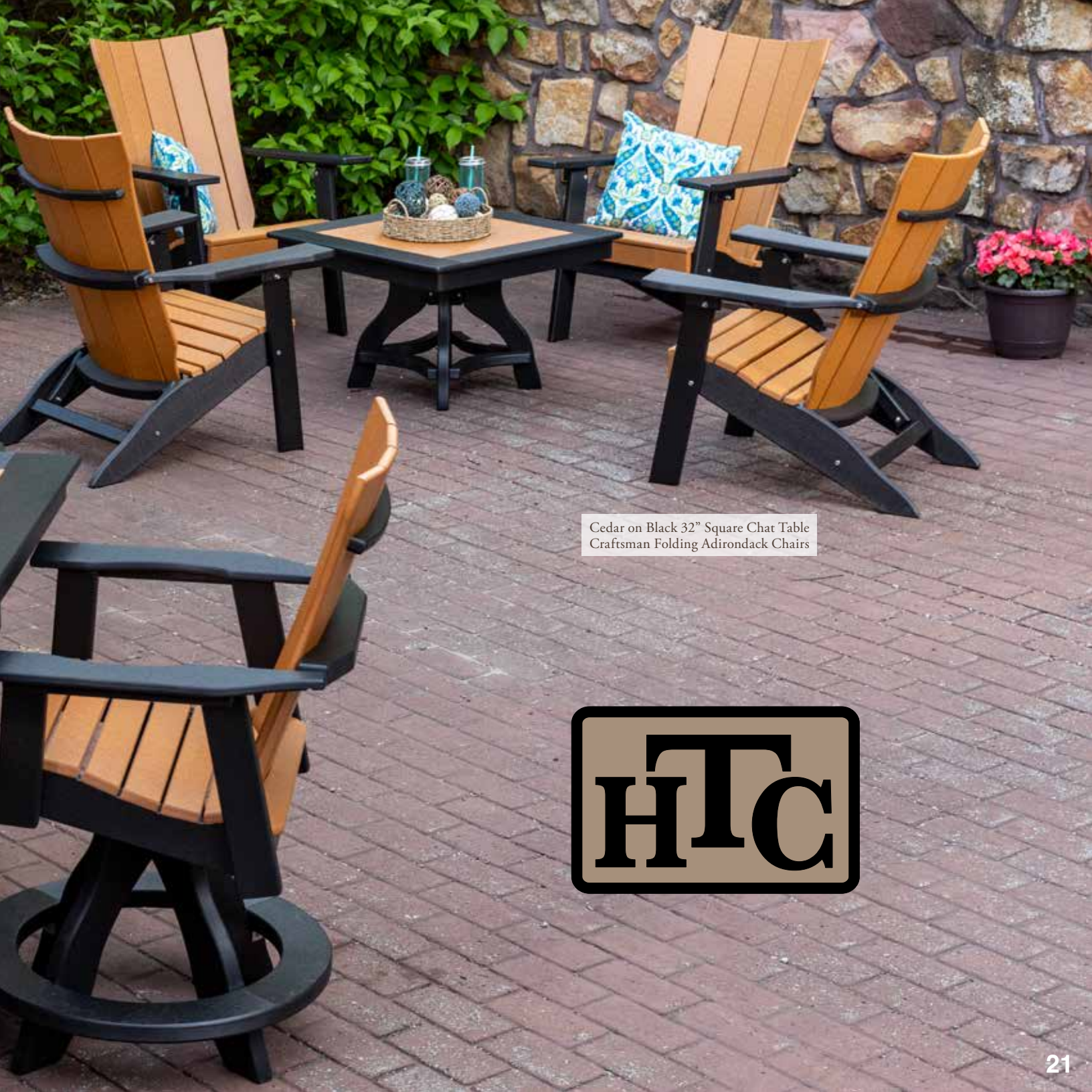
Cedar on Black 32" Square Chat Table Craftsman Folding Adirondack Chairs