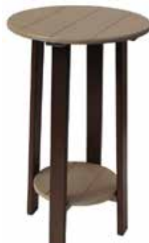
Round Bar End Table #RETB - 44 21" W x 34" H - (19 lbs.)