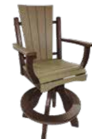
Daisy Square Swivel Bar Chair #QASB - 24 26" W x 28" D x 49" H Seat - 29 1/2" (61 lbs.)