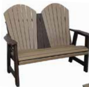
Comfy-Back Garden Bench #CGB - 8 54" W x 27" D x 40" H Seat - 17" H (68 lbs.)