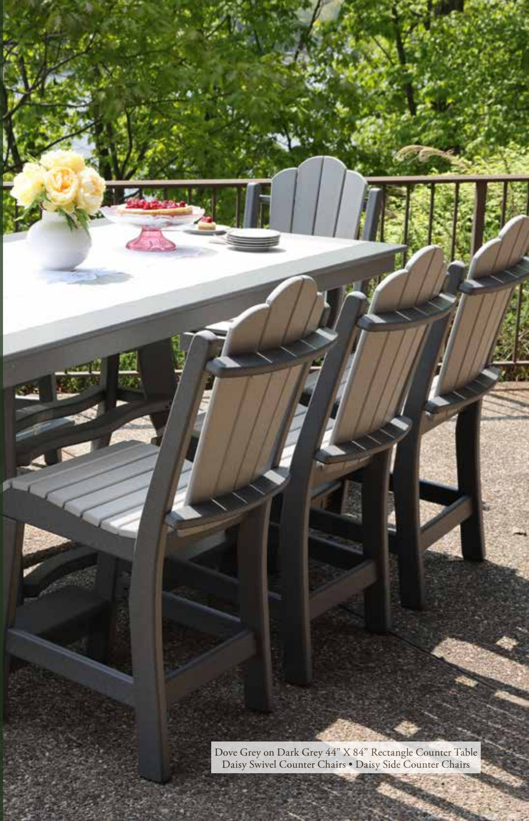
Dove Grey on Dark Grey 44" X 84" Rectangle Counter Table Daisy Swivel Counter Chairs • Daisy Side Counter Chairs