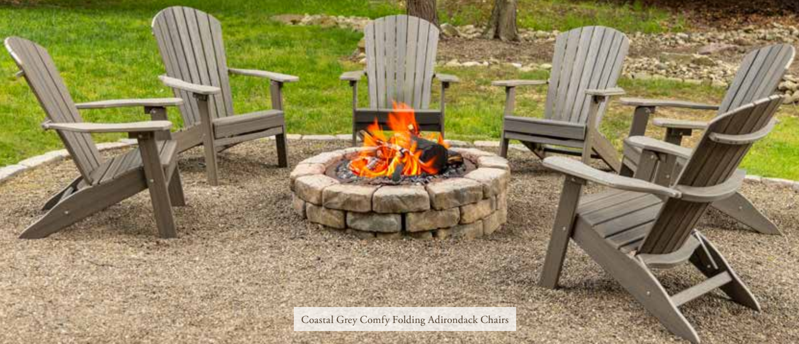
Coastal Grey Comfy Folding Adirondack Chairs