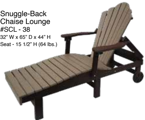
Snuggle-Back Chaise Lounge #SCL - 38 32" W x 65" D x 44" H Seat - 15 1/2" H (64 lbs.)