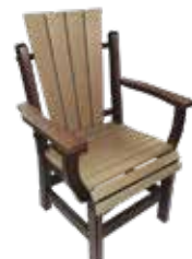
Daisy Square Arm Dining Chair #QAD - 16 26" W x 20" D x 37" H Seat - 17 1/2" H (30 lbs.)