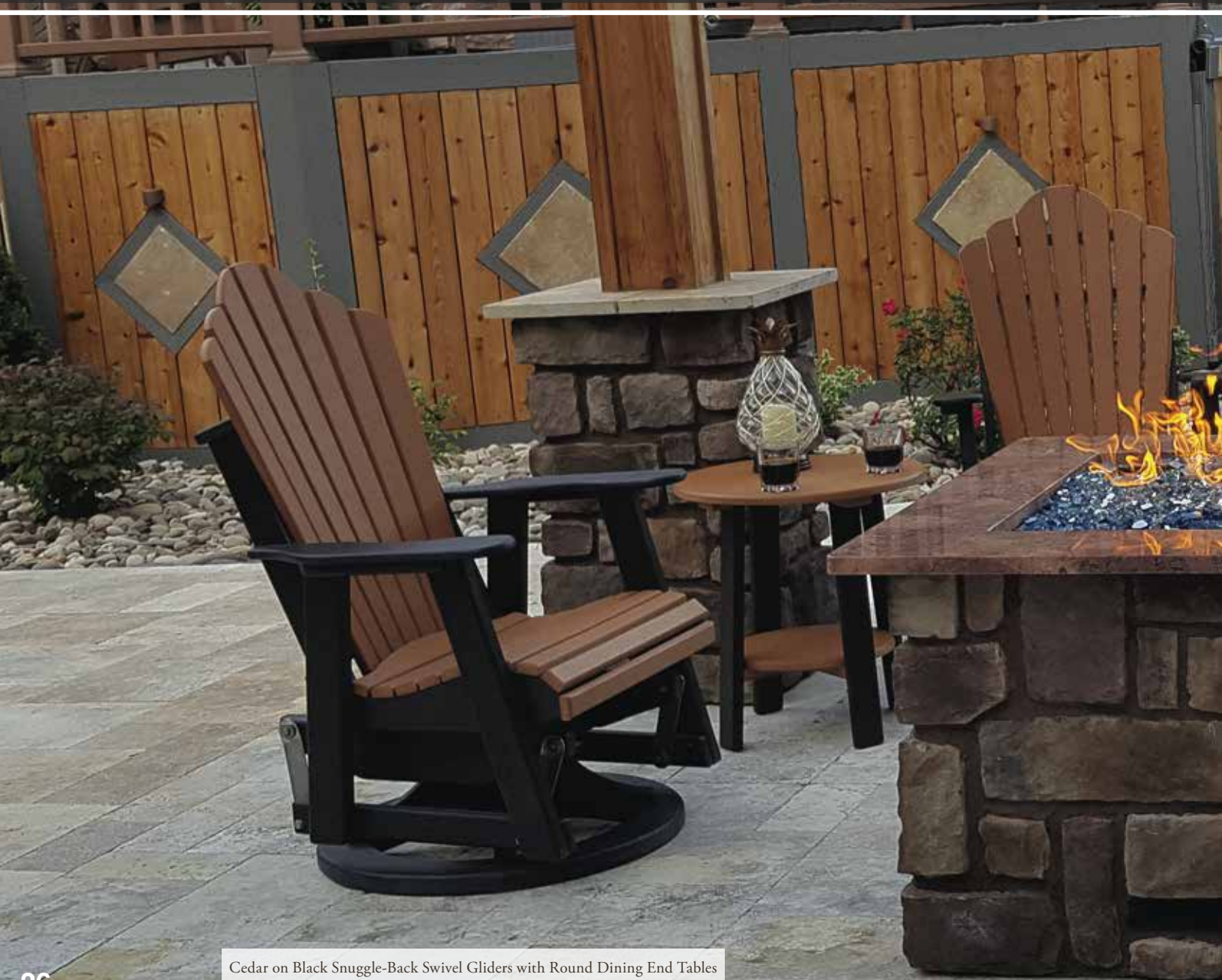
Cedar on Black Snuggle-Back Swivel Gliders with Round Dining End Tables