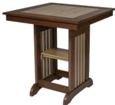
32" Square Brunch / Buffet Table Dining Height #BBSQD32 • 29.5" H - (72 lbs.)