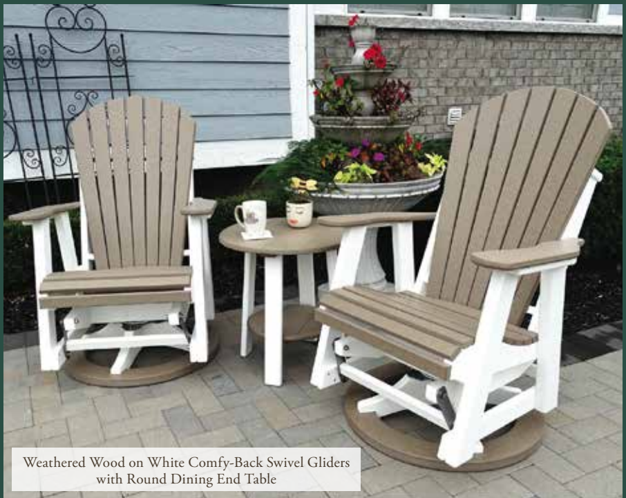
Weathered Wood on White Comfy-Back Swivel Gliders with Round Dining End Table