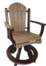
Daisy Comfy Swivel Counter Chair #DCSWC - 23 26" W x 30" D x 43" H Seat - 23 3/4" (59 lbs.)