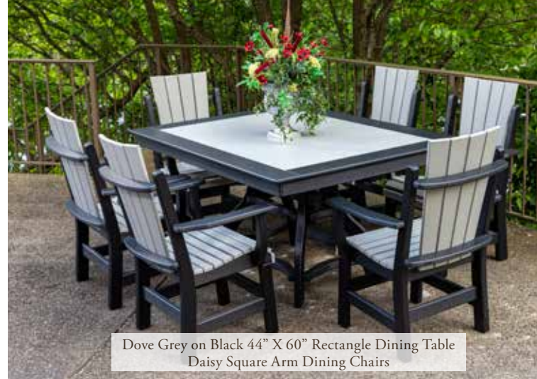
Dove Grey on Black 44" X 60" Rectangle Dining Table Daisy Square Arm Dining Chairs