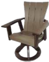
Craftsman Swivel Dining Chair #QBSD - 39 28" W x 26" D x 37" H Seat - 17 1/2" H (40 lbs.)