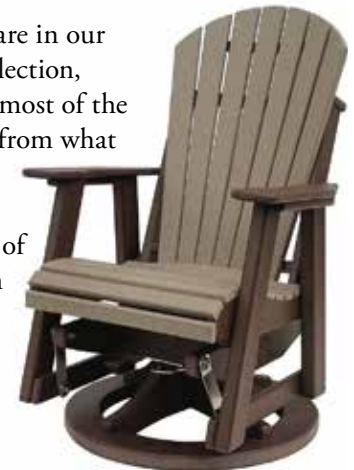
Comfy-Back Swivel Glider

* At HTC, we custom shape the edges on each piece of poly lumber. We custom shape every single slat, from the seat to the back assembly all the way down to the leg assembly. In contrast, our competitors typically construct their furniture using the Raw Poly Lumber as it comes with it's original factory edges.