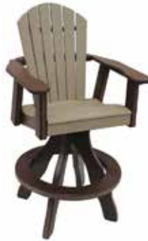
Comfy-Back Swivel Bar Chair #CBSB - 41 28" W x 30" D x 50" H Seat - 29 3/4" (61 lbs.)