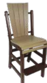
Daisy Square Side Bar Chair #QSB - 15 19" W x 25" D x 49" H Seat - 29 1/2" (35 lbs.)