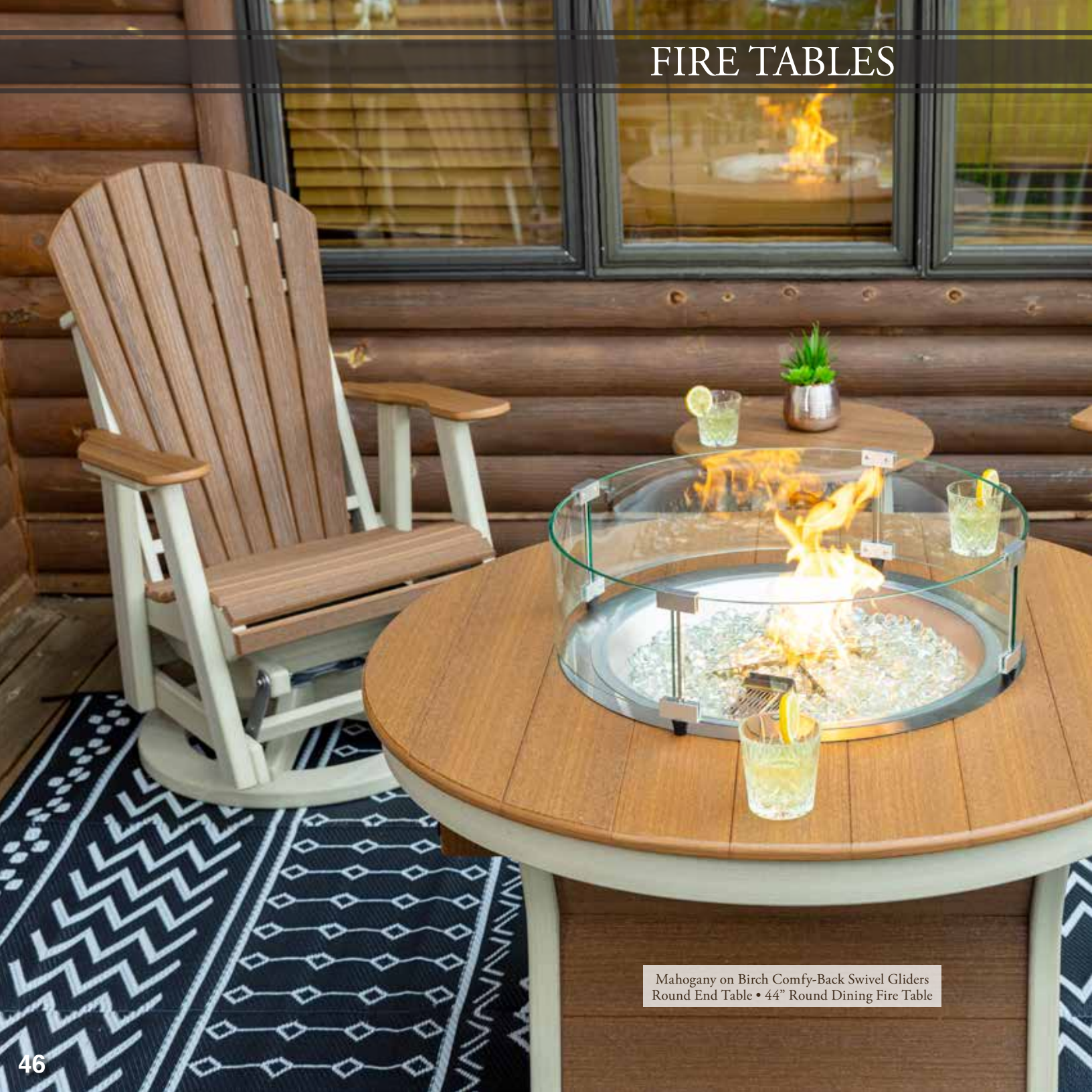
Mahogany on Birch Comfy-Back Swivel Gliders Round End Table • 44" Round Dining Fire Table