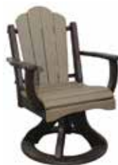
Daisy Arm Swivel Dining Chair #DASD - 22 26" W x 26" D x 37" H Seat - 17 1/2" H (40 lbs.)