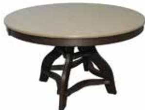
48" Round Dining Table #48-RTD • 29.5" H - (86 lbs.)