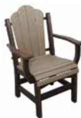
Daisy Arm Dining Chair #DAD - 16 26" W x 20" D x 37" H Seat - 17 1/2" H (30 lbs.)