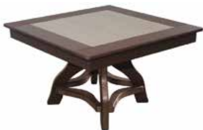
32" Square Chat Table #32-SCT • 18" H - (54 lbs.)