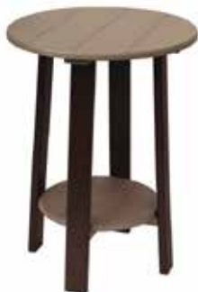
Round Counter End Table #RETC - 43 21" W x 28" H - (18 lbs.)