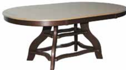
44" x 72" Oval Dining Table #44x72-OTD • 29.5" H - (124 lbs.)