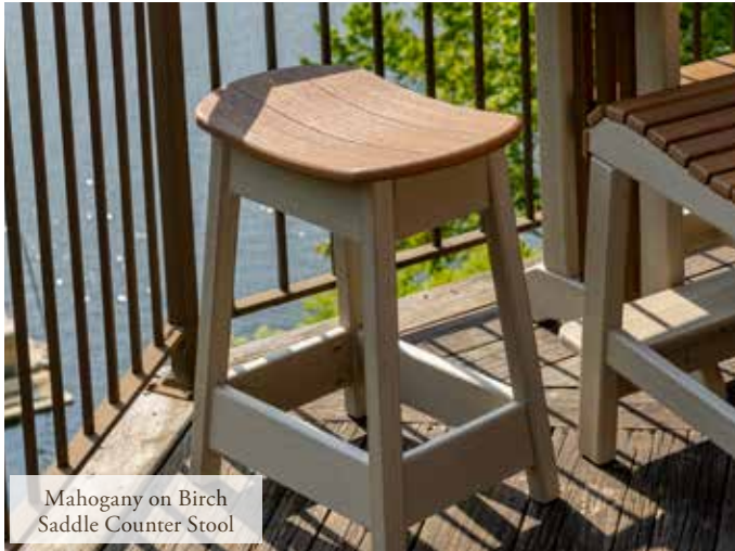
Mahogany on Birch Saddle Counter Stool