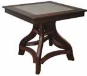
32" Square Dining Table #32-STD • 29.5" H - (63 lbs.)