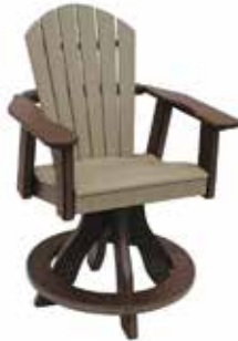
Comfy-Back Swivel Counter Chair #CBSC - 40 28" W x 30" D x 44" H Seat - 23 3/4" (59 lbs.)