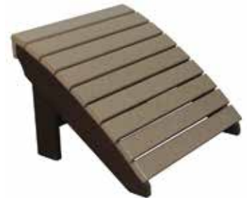
Adirondack Footstool #AF - 34 21" W x 22" D x 16" H - (18 lbs.)