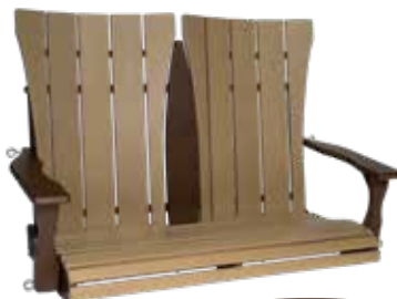
Craftsman 4' Swing #QS4 53" W x 28" D x 30" H (71 lbs.)