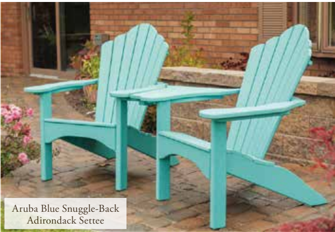
Aruba Blue Snuggle-Back Adirondack Settee