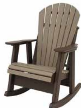
Comfy-Back Rocker #CBR - 47 29" W x 32" D x 42" H Seat - 17" H (47 lbs.)

*Our Swings all come with Stainless Steel Chains.