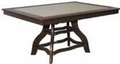
44" x 60" Rectangular Dining Table #44x60-RTD • 29.5" H - (124 lbs.)