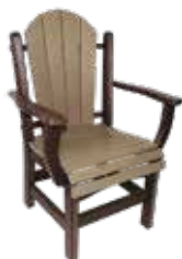
Daisy Comfy Arm Dining Chair #DCAD - 16 26" W x 20" D x 37" H Seat - 17 1/2" H (30 lbs.)