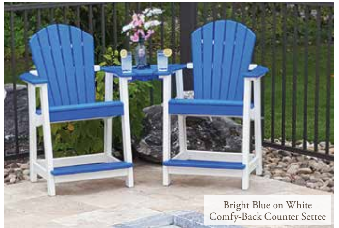
Bright Blue on White Comfy-Back Counter Settee