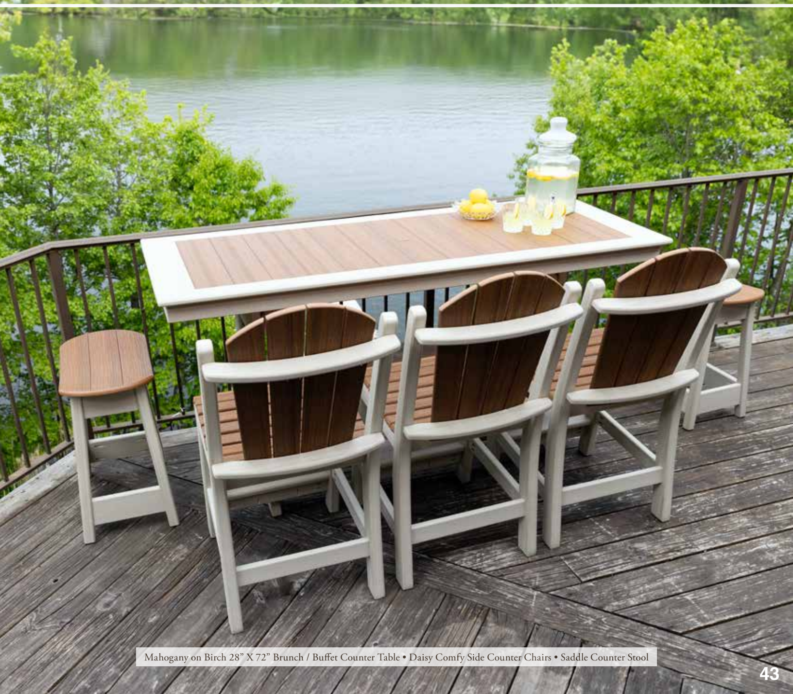
Mahogany on Birch 28" X 72" Brunch / Buffet Counter Table • Daisy Comfy Side Counter Chairs • Saddle Counter Stool

INNOVATIVE, VERSATILE & A SOLID BEST-SELLER!