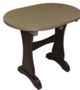
Oval End Table #OET - 2 22" W x 15" D x 20" H - (14 lbs.)