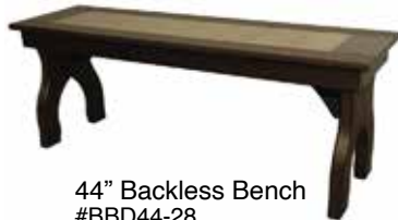
44" Backless Bench #BBD44-28 14" D x 44" W • (Approx. 36 - 39 lbs.)