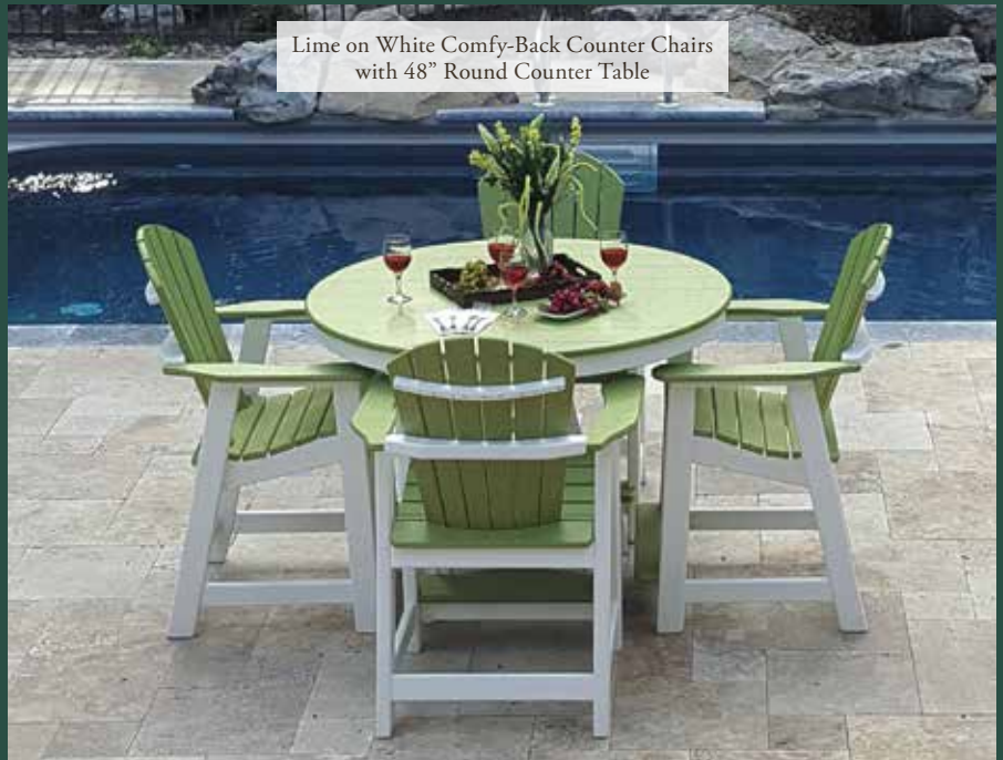
Lime on White Comfy-Back Counter Chairs with 48" Round Counter Table