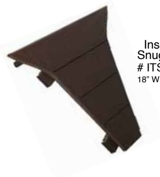
Insert Table for Snuggle-Back Settee #ITS - 35 18" W x 20" D - (6 lbs.)