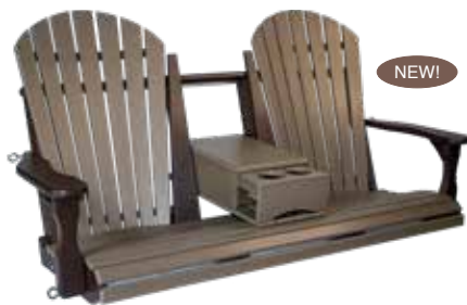
Comfy-Back 5' Swing with Console #CS5C 65" W x 28" D x 30" H (92 lbs.)