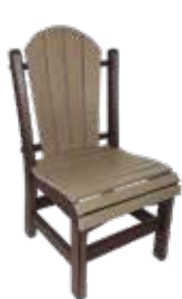
Daisy Comfy Side Dining Chair #DCSD - 13 19" W x 20" D x 37" H Seat - 17 1/2" H (26 lbs.)