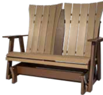
Craftsman Double Glider #QDG - 5 54" W x 31" D x 41" H Seat - 17 1/2" H (97 lbs.)