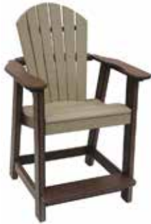
Comfy-Back Counter Chair #CBC - 20 28" W x 30" D x 44" H Seat - 23 3/4" (45 lbs.)