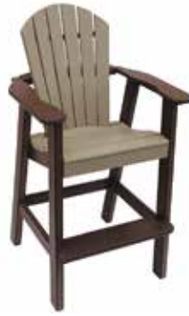
Comfy-Back Bar Chair #CBB - 21 28" W x 30" D x 50" H Seat - 29 3/4" (47 lbs.)