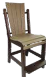
Daisy Square Side Counter Chair #QSC - 14 19" W x 24" D x 43" H Seat - 23 1/2" (29 lbs.)