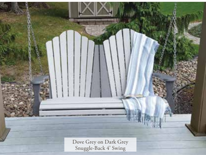
Dove Grey on Dark Grey Snuggle-Back 4' Swing