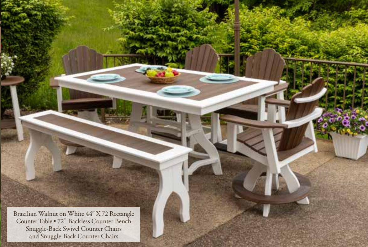
Brazilian Walnut on White 44" X 72" Rectangle Counter Table • 72" Backless Counter Bench Snuggle-Back Swivel Counter Chairs and Snuggle-Back Counter Chairs