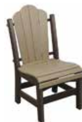
Daisy Side Dining Chair #DSD - 13 19" W x 20" D x 37" H Seat - 17 1/2" H (26 lbs.)