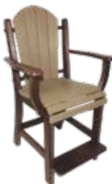
Daisy Comfy Arm Counter Chair #DCAC - 17 26" W x 24" D x 43" H Seat - 23 1/2" (33 lbs.)