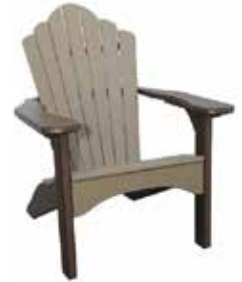
Snuggle-Back Adirondack Chair #SA - 7 31" W x 31" D x 40" H Seat - 16" H (40 lbs.)