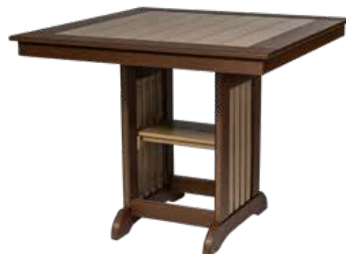
44" Square Brunch / Buffet Table Dining Height #BBSQD44 • 29.5" H - (104 lbs.)