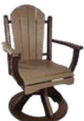
Daisy Comfy Swivel Dining Chair #DCSWD - 22 26" W x 26" D x 37" H Seat - 17 1/2" H (40 lbs.)