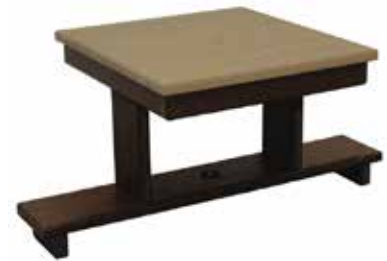
Gliding Settee Table #GST - 33 18" W x 19" D - (18 lbs.)