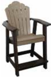
Snuggle-Back Counter Chair #SBC - 20 28" W x 30" D x 44" H Seat - 23 3/4" H (45 lbs.)