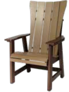
Craftsman Garden Chair #QGC 29" W x 30" D x 44" H Seat - 17 1/2" H (44 lbs.)