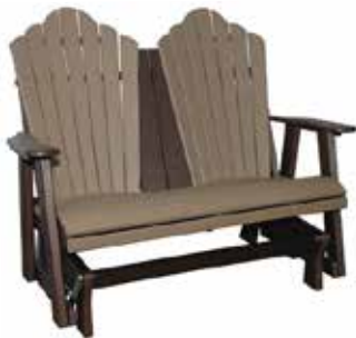
Snuggle-Back Double Glider #SDG - 5 54" W x 31" D x 41" H Seat - 17" H (90 lbs.)

Our Swivels are Manufactured in the U.S.A.!