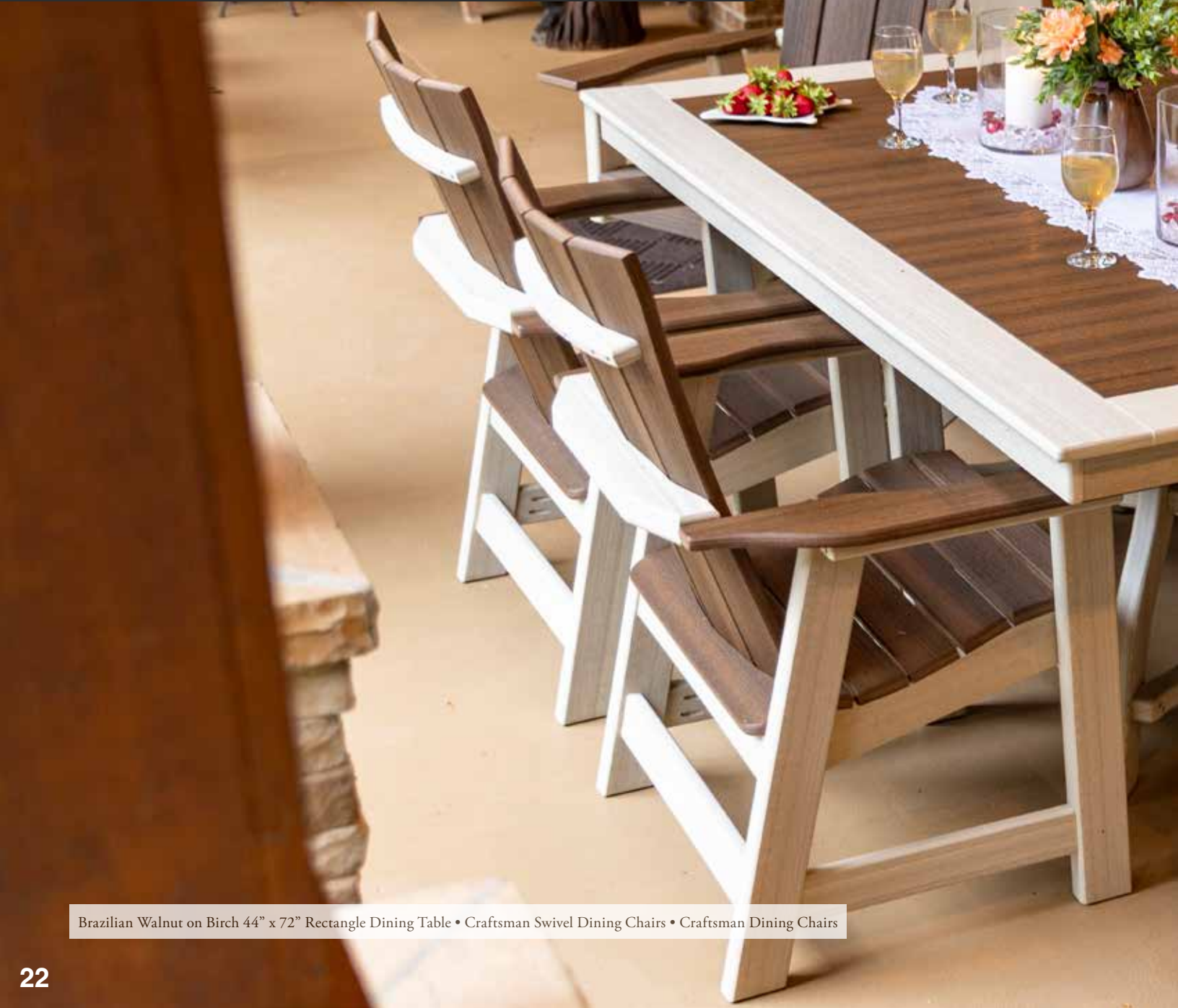
Brazilian Walnut on Birch 44" x 72" Rectangle Dining Table • Craftsman Swivel Dining Chairs • Craftsman Dining Chairs