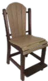
Daisy Comfy Side Counter Chair #DCSC - 14 19" W x 24" D x 43" H Seat - 23 1/2" (29 lbs.)