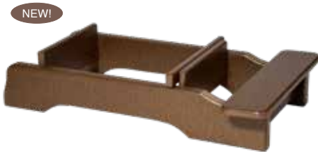
Single Glider Attachment #SGA 23" W x 37" D x 8" H - (21 lbs.)