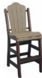
Daisy Side Bar Chair #DSB - 15 19" W x 25" D x 49" H Seat - 29 1/2" (35 lbs.)