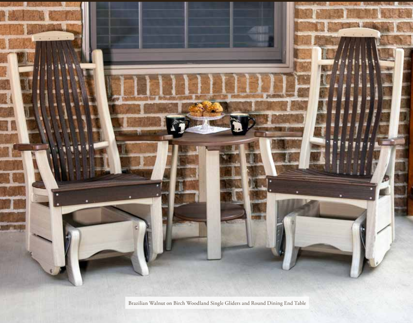
Brazilian Walnut on Birch Woodland Single Gliders and Round Dining End Table