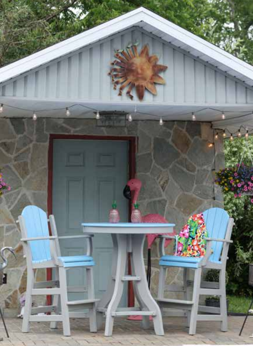
Powder Blue on Dove Grey 36" Round Bar Table with Daisy Comfy Arm Bar Chairs