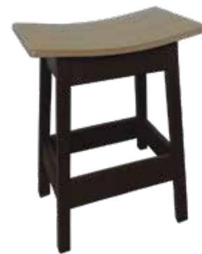
Bar Square Saddle Stool #QBS - 49 20" W x 29" H x 12" D - (21 lbs.)