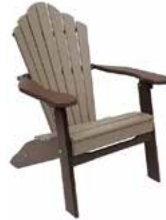
Snuggle-Back Folding Adirondack Chair #SFA - 45 31" W x 31" D x 41" H Seat - 16" H (41 lbs.)