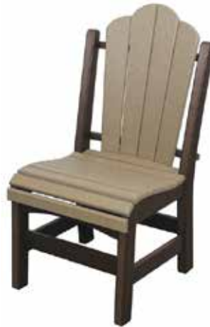
Daisy Side Dining Chair