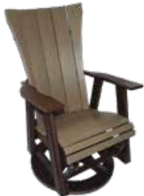
Craftsman Swivel Glider #QBSG - 46 29" W x 32" D x 43" H Seat - 17 1/2" H (76 lbs.)