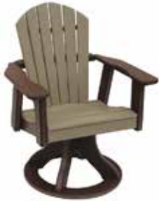
Comfy-Back Swivel Dining Chair #CBSD - 39 28" W x 26" D x 37" H Seat - 17 1/2" H (40 lbs.)