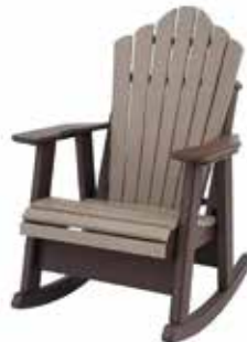
Snuggle-Back Rocker #SBR - 47 29" W x 32" D x 42" H Seat - 17" H (47 lbs.)