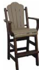
Daisy Arm Bar Chair #DAB - 18 26" W x 25" D x 49" H Seat - 29 1/2" (39 lbs.)