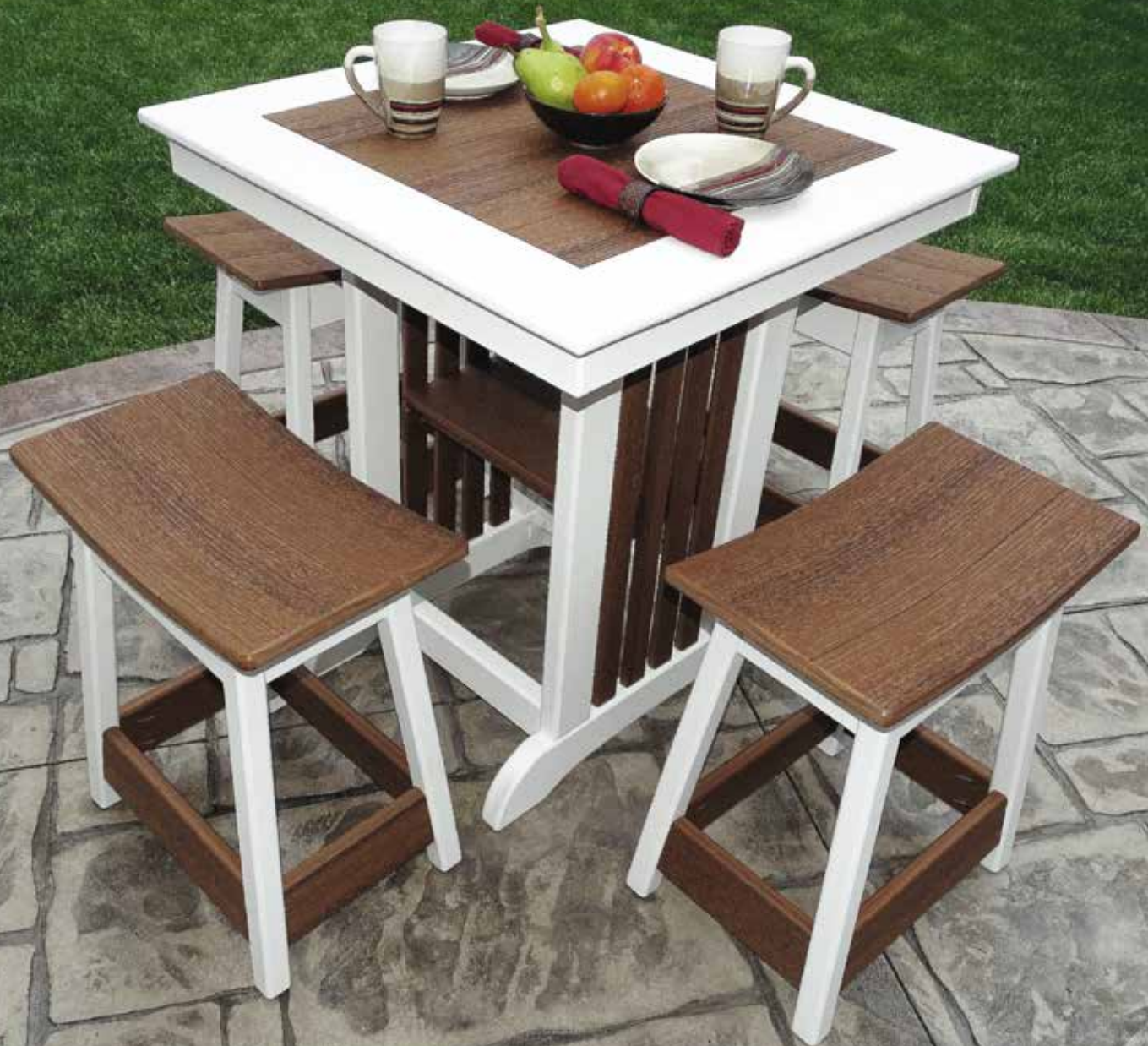
Mahogany on White 36" Square Counter Brunch / Buffet Table with Square Counter Saddle Stools