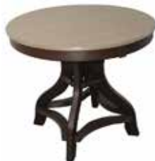
36" Round Dining Table #36-RTD • 29.5" H - (57 lbs.)