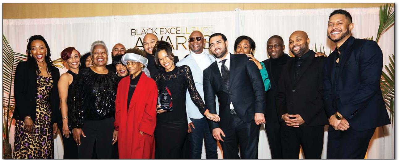
Award honorees & their families.