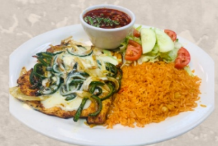
POLLO A LA PARRILLA