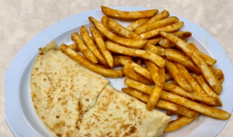
CHEESE QUESADILLA AND FRIES