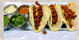
TACOS AL PASTOR