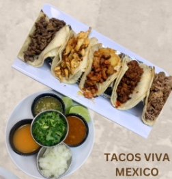
TACOS VIVA MEXICO