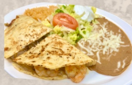
FAJITA QUESADILLA SHRIMP

A large flour tortilla filled with marinated shredded beef served with some soup and rice. $15.99