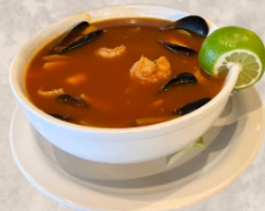
CALDO DE MARISCO

Seafood soup; shrimp, scallops, fish, crab legs, mixed vegetables with a side of rice. $16.99