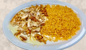
POLLO CON ARROZ

Grilled chicken strips with chorizo topped with cheese sauce served with rice and beans. $15.99