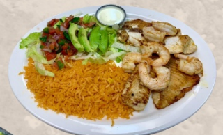
TILAPIA AND SHRIMP