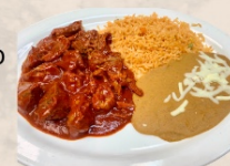
CHILE ROJO PORK