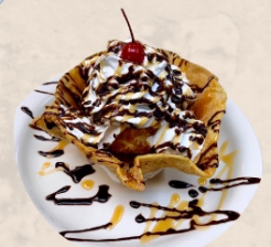
DEEP-FRIED ICE CREAM