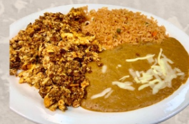
HUEVOS CON CHORIZO

*CONSUMING RAW OR UNDERCOOKED MEATS, POULTRY, SEAFOOD, SHELLFISH OR EGGS MAY INCREASE YOUR RISK OF FOODBORNE ILLNESS ESPECIALLY IF YOU HAVE A MEDICAL CONDITION.