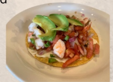
TOSTADA DE CAMARON