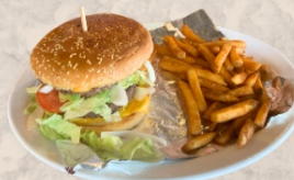
EL JEFE BURGER