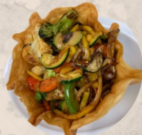
VEGGIE TACO SALAD

Potato burrito covered in red sauce, rice, and beans. $11.50