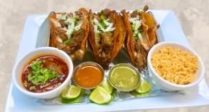
TACOS DE BIRRIA

Large flour tortilla filled with grilled chicken, steak, and shrimp sautéed bell peppers and onions served with rice and beans. $16.99