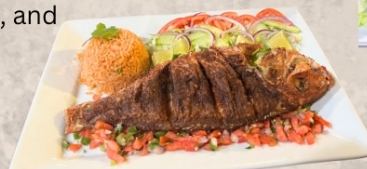
HUACHINANGO AL MOJO DE AJO