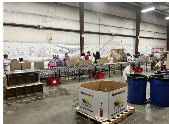
Community Food Bank