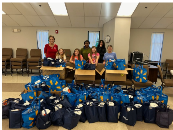
Groceries for Freedom Manor