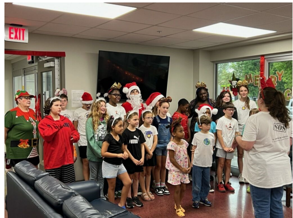
Freedom Manor Christmas in July