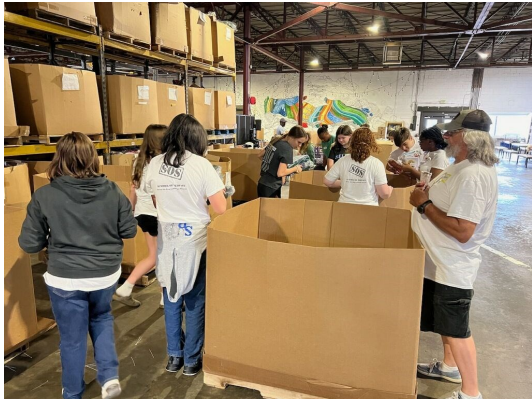
Christian Service Mission