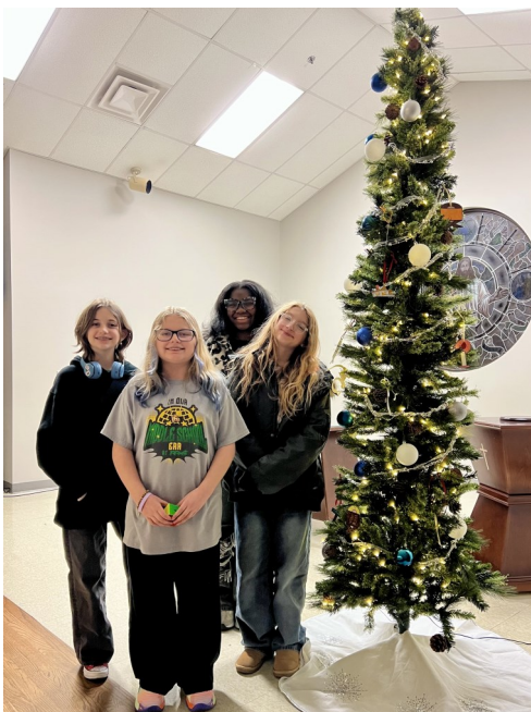
Adding some of our handmade Chrismon ornaments to the Luther Room tree