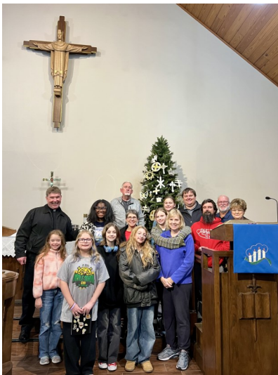
Decorating the Chrismon (Christ Monograms) Tree