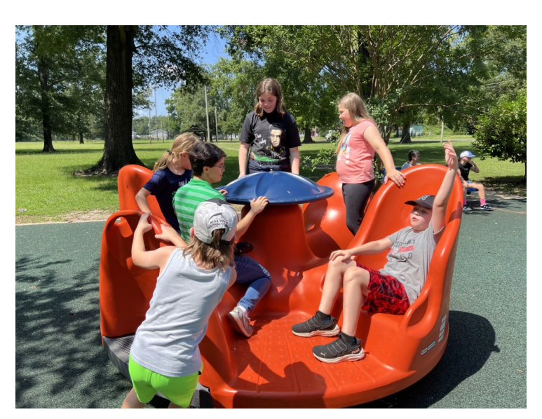
We picked up trash around the community playground and then played on it!