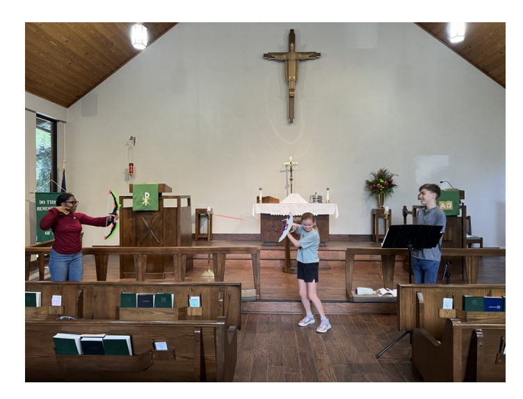
Did you miss Youth-led Worship on July 31? Watch the recording! https://www.youtube.com/watch? v=VEcHFV862xU

Sept 29 Children Ministry Family Picnic at Pelham Park (off Hwy 31) immediately following 10:40 worship. Bring a picnic lunch & come play and fellowship with us!