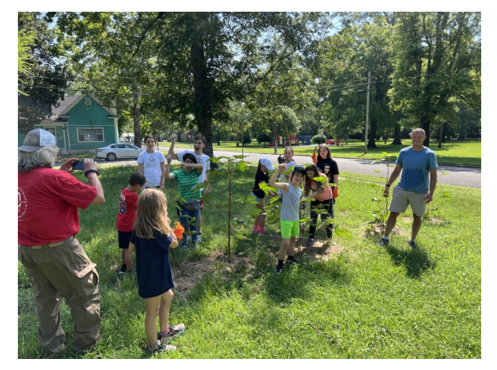
We picked okra