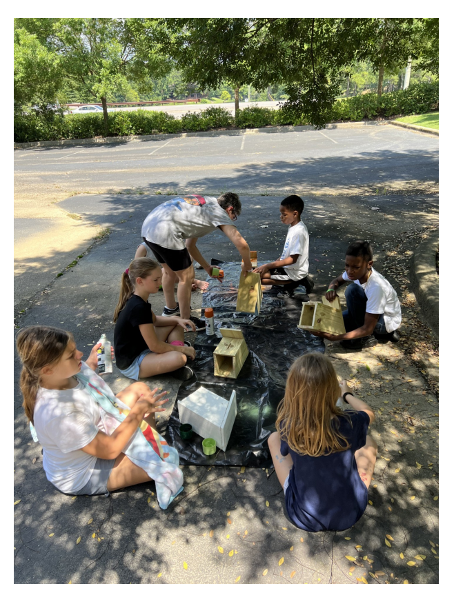
And we had a celebration lunch and painted butterfly houses to remind us of God's Awesome Creation, out theme for the summer. A big thank you to everyone for making this happen!