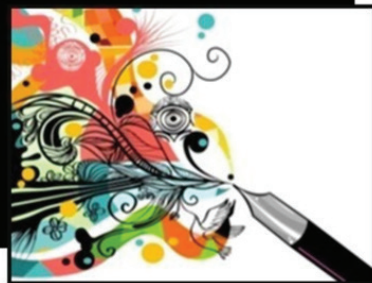
The Keating Award