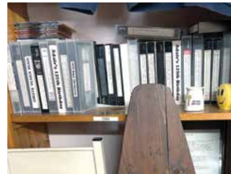
VHS tapes from various events in Adair's history.