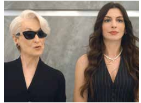
"The Devil Wears Prada 2"