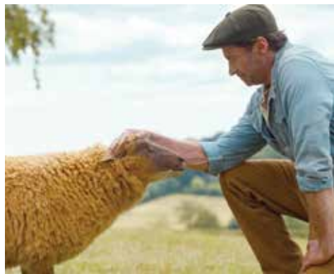
"The Sheep Detectives"