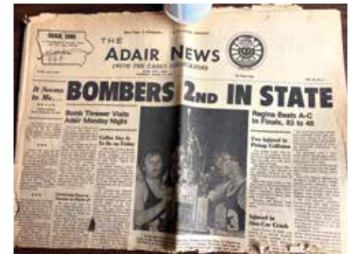
A newspaper report on the state runner-up boys basketball team in 1979.