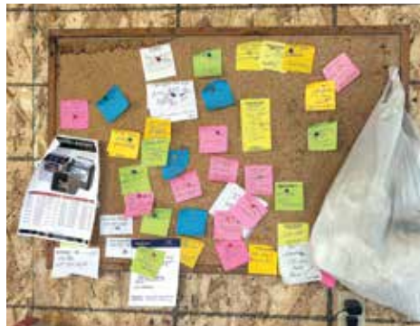
Wilbur Bates uses a low-tech but highly effective scheduling system.

The Bates business model focuses on prompt service, low prices and free pick-up and delivery. The shop is located in the garage behind his home at 602 State St. in Guthrie Center. The phone number is 641-757-1243. ■