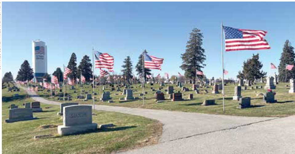
The American flags wave in the wind at Union Cemetery in Guthrie Center. Numerous rules are in place on how to properly display U.S. flags.

For those who get a bang out of personal fireworks, it is important to be aware of state and local laws regarding use. For decades, almost all personal fireworks were illegal in Iowa, other than sparklers, "snakes" and "poppers." But in 2017, Iowa law changed to allow a variety of bottle