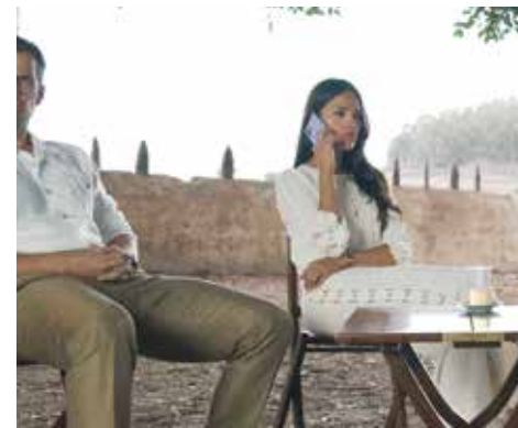
"In the Grey"