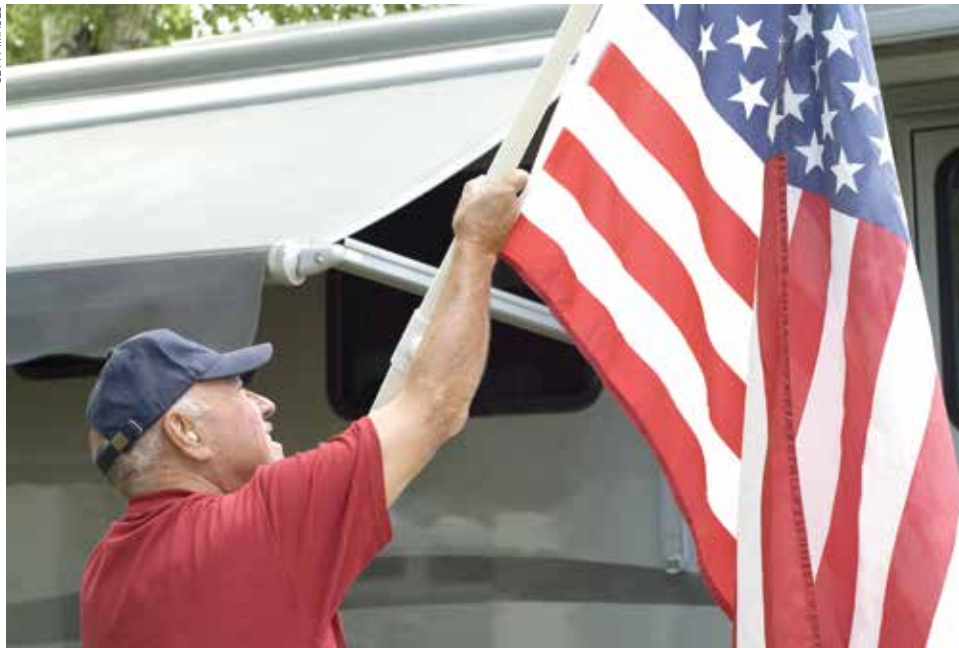
Camping at Springbrook State Park is a popular Fourth of July activity.

ers to complete the reservation before pulling into a campsite, because she has seen situations in which a family pulls into an empty site, begins setting up while making a reservation, and then discovers the site is already reserved by someone else. The family then must undo everything they just set up and move to an available spot, if any remain.