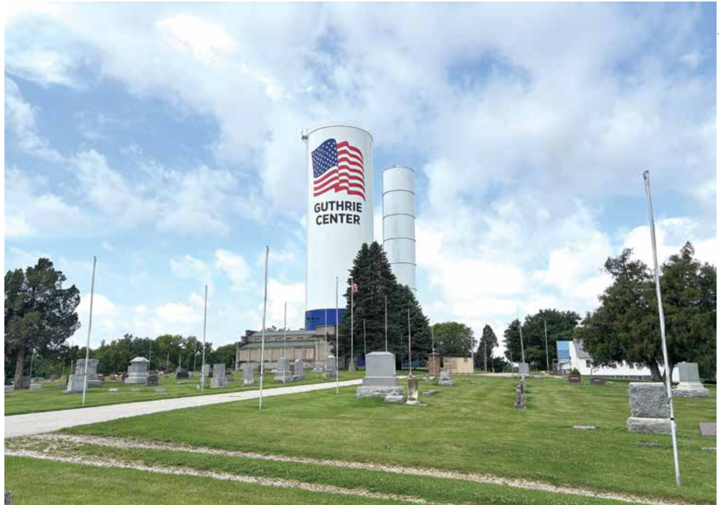
A large U.S. flag painted on the water tower welcomes all to Guthrie Center.

Most likely, the largest U.S. flag in Guthrie County is the image painted on the side