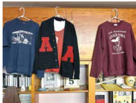
An Adair letter jacket and sweatshirts from Adair events.

"In the summers, especially, we'll get road trip people that stop in and spend quite a bit of time just looking through, because they're interested in history," she said. ■