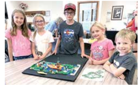
At LEGO Mania Day, the summer reading challenge was to create 3D images of flowers or plants.

The Science Center of Iowa is another venue that provides exhibits, experiments and attractions for all ages that participates