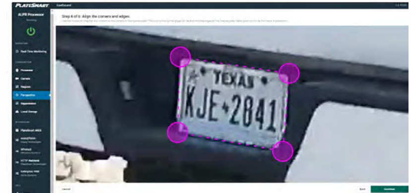
Perspective correction lets you identify the edges of angled plates passing a camera so PlateSmart ARES can read them as if they were captured head-on.

Not every camera can be placed to capture a plate head-on. Perspective Correction lets you fix that, making plates at up to a 45° angle look as if they are directly in front of the camera. The result? Dramatically improved accuracy without the need to move the camera.