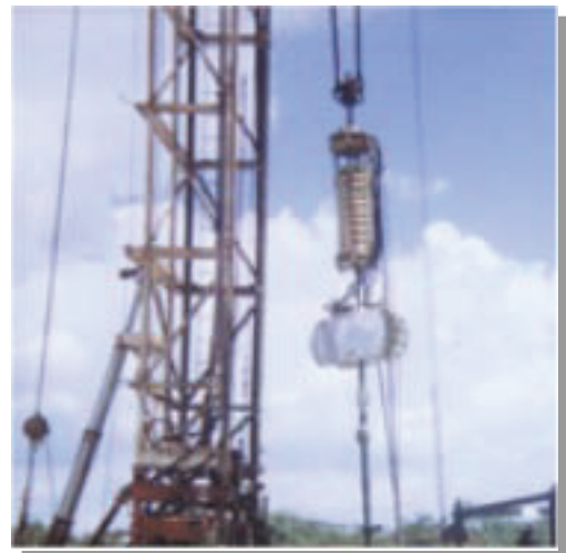
Vibration Technology Oscillator Used For Gravel Pack Screen Recovery