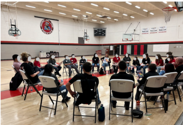
Talking Circle at Vineland Middle School

The Sources of Strength program is a universal, school-based program that is designed to change the norms and behaviors surrounding suicide within a school community and increase social support and connectedness among students, including suicidal students.