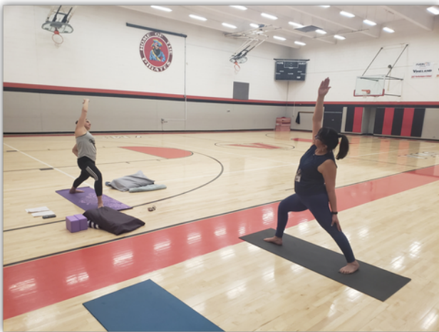
Training at Swallows Charter Academy