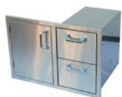
Combination Door and Drawers - CD2DRW