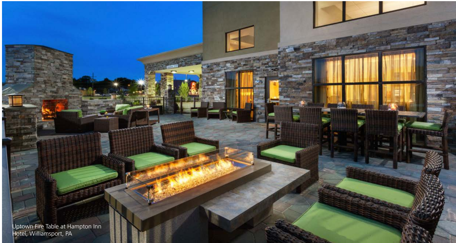
Uptown Fire Table at Hampton Inn Hotel, Williamsport, PA

Commercially-rated outdoor products by The Outdoor GreatRoom Company™ include gas burners, fire pits, fire tables, and outdoor kitchens. Both standard and custom products can be commercially-rated and include added safety features. All fire products use our UL listed Crystal Fire™ Burner. Perfect for multi-family residences, hotels, sports stadiums, restaurants, and more. We strive to deliver the best product for your commercial setting and professional customer service before, during, and after your commercial project. Visit outdoorrooms.com/Commercial to get more information regarding our commercial services.