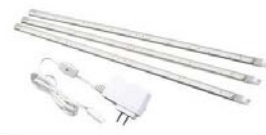
Under Counter Lighting LED-STRIP