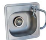
Stainless Steel Sink SINK