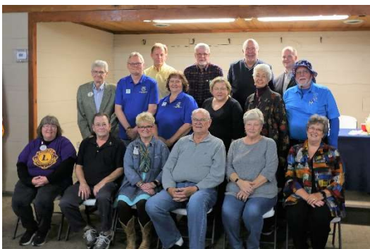
Board of Directors present at the October Quarterly meeting.