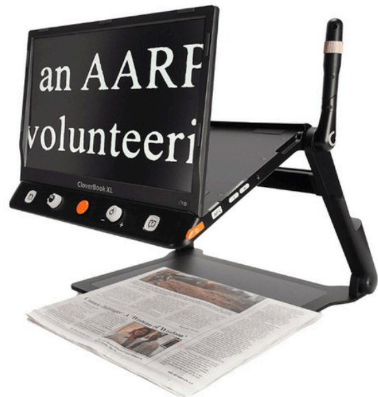
Clover Book- have two sizes, have one text to talk. Presently have three.