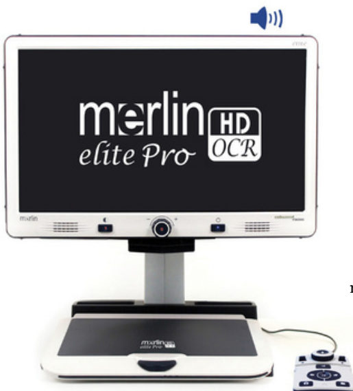
Merlin Pro Elite- magnifier with talk to text. Have one.