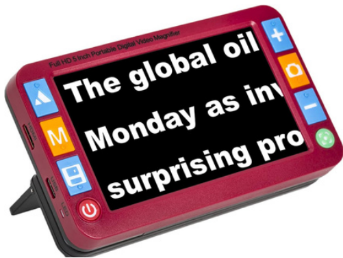
Handheld magnifier, has handle also. Presently have two.

The Low Vision Department has been adding new low vision equipment. This equipment is used for those with low vision in their home to see better. We have Digital Magnifiers that you can place a book or paper under to be able to read. We also have smaller handheld magnifiers. They are good for reading directions on a box, reading a prescription bottle, reading the mail, and many other uses around the house, grocery store, or restaurant. If there is someone in your community who needs equipment like, let us know and we can help place this low vision equipment.