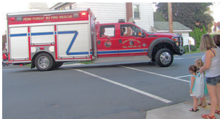
Penn Forest Township Volunteer Fire Company Number 2 took part in the parade that kicked off White Haven Volunteer Fire Company's Bazaar over the weekend.

We were outside again on Friday evening to enjoy the White Haven Fire Company Bazaar, and then moved into a good spot to enjoy the annu-