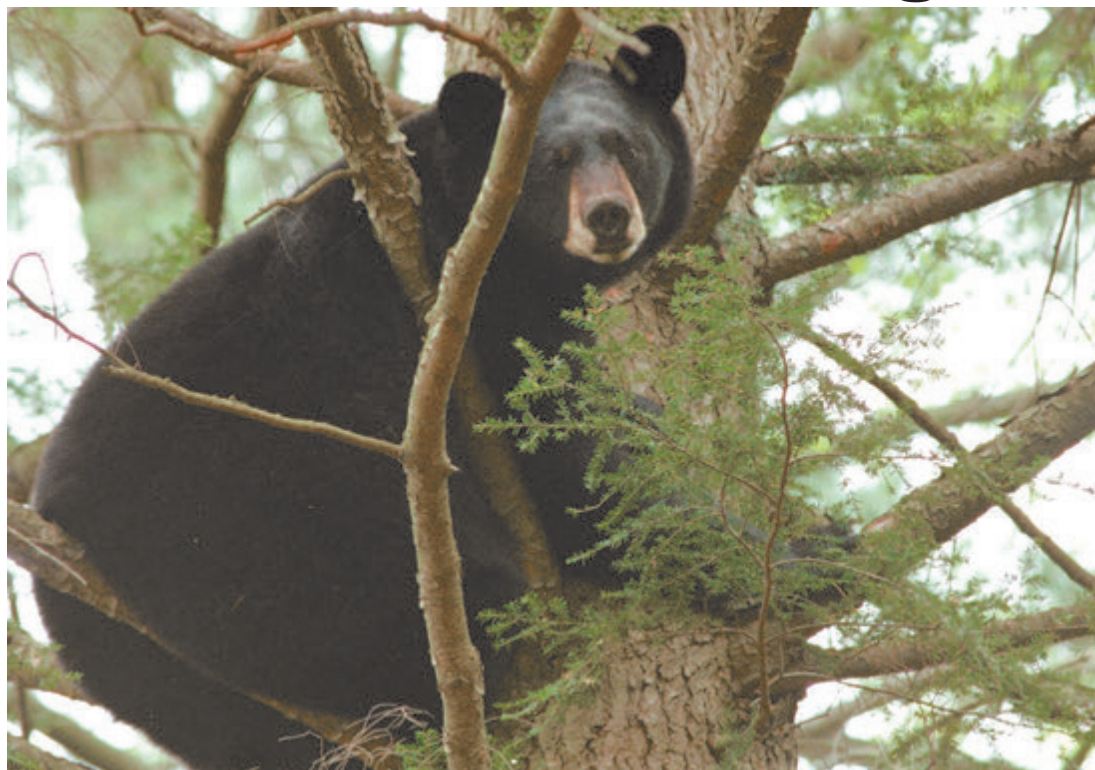
A Black Bear.

Ternent's career in wildlife research has focused on black bears since 1991, and he has been employed