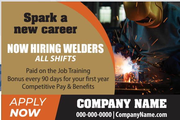
Midwest 2 x 2 Display Sample Ad (3" x 2")

for results that really ad up for your employee searches