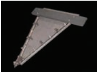
PFF Board cleaned and re-assembled