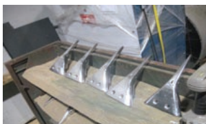
Goss Former Noses (Repaired, Hard Chrome Plated and Polished)