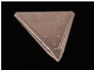
Refurbished PFF Former Board