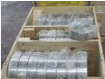
Bearer Rings for Baker G-14 (H-13 or Stainless Steel)