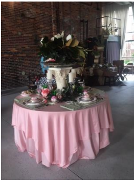
“Blossom Time” sponsored by Wine, Food, Joy/ Perry Hall;