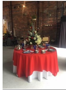
“Celebrate America” sponsored by Kings Mountain Messenger Chapter, NSDAR; 4