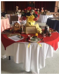
“Honoring Gulf War Veterans – S.O.S.” sponsored by S.O. S. Survivors of the Storm – Veterans Group est. 1991;