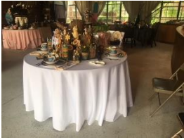
“It’s a Cat’s World” sponsored by Southern Alliance Spay Neuter Clinic;

Thanks to all of the Table Sponsors for their beautifully decorated tables. All were filled with details showcasing their business and table theme!