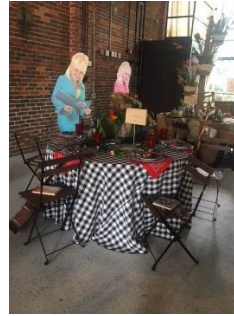
“Delivering Books to our Children” sponsored by Imagination Library of Lincoln County;