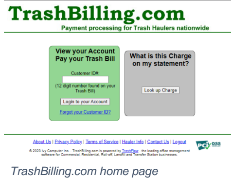
TrashBilling.com home page