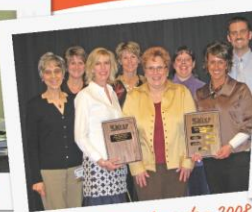
Shopper Awards - 2008