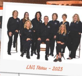
LNS Team - 2023