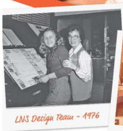
LNS Design Team - 1976