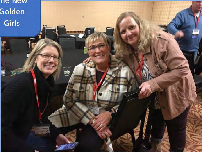
The New Golden Girls