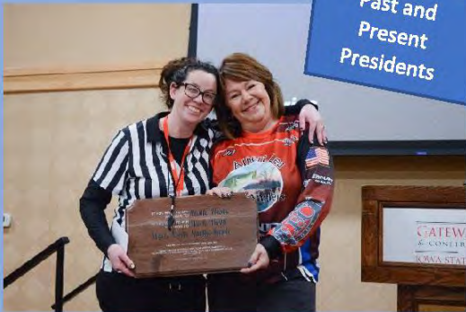
Past and Present Presidents