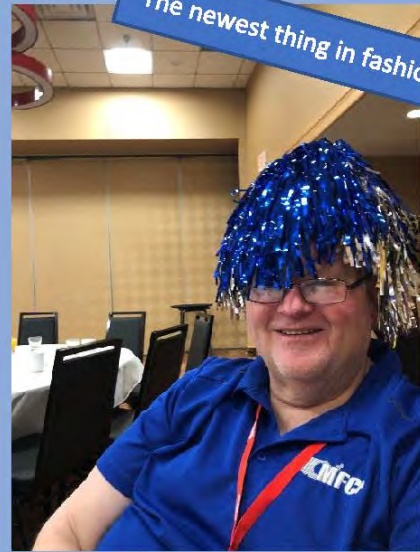
The newest thing in fashion