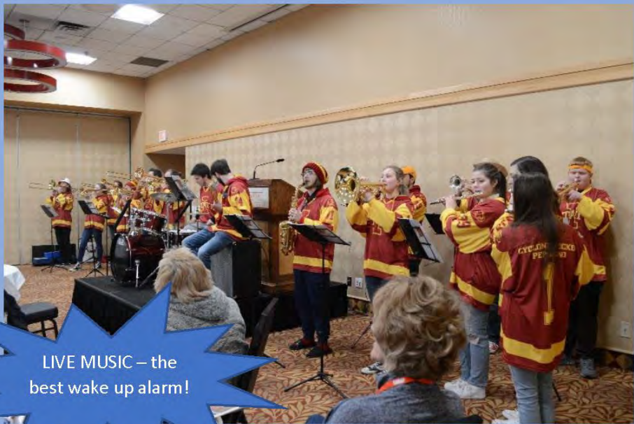
LIVE MUSIC – the best wake up alarm!