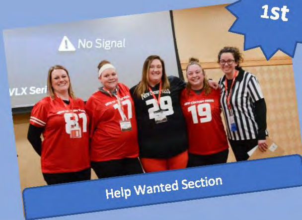
Help Wanted Section