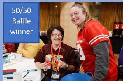
50/50 Raffle winner