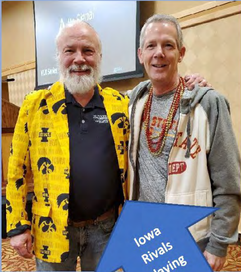
Iowa Rivals playing nice