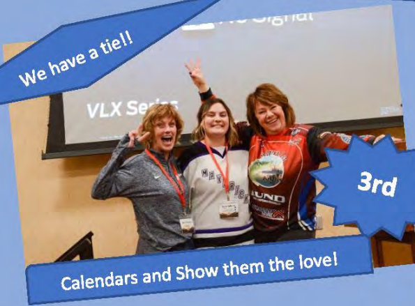
Calendars and Show them the love!