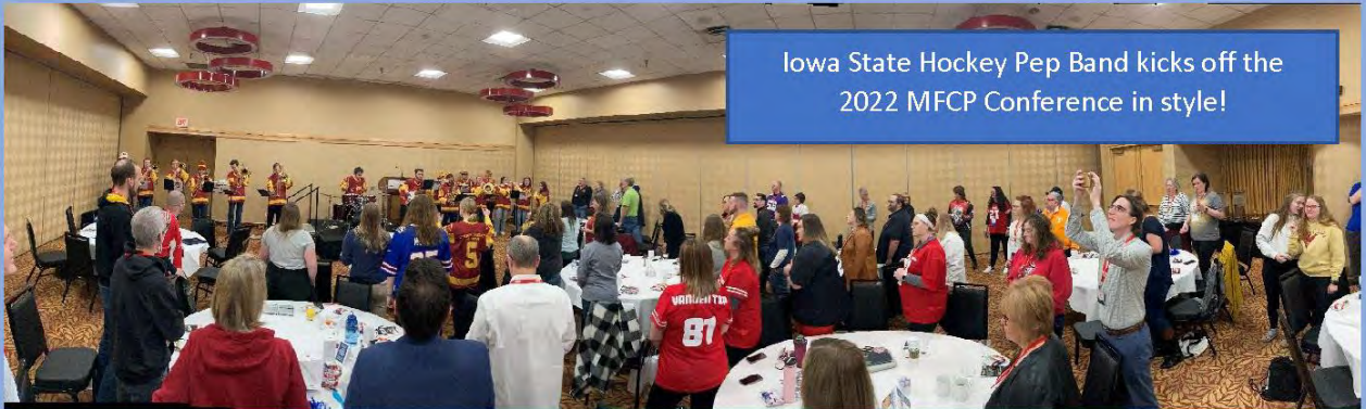
Iowa State Hockey Pep Band kicks off the 2022 MFCEP Conference in style!