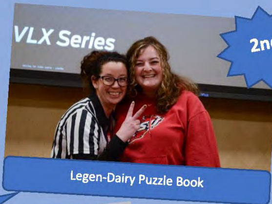
Legen-Dairy Puzzle Book