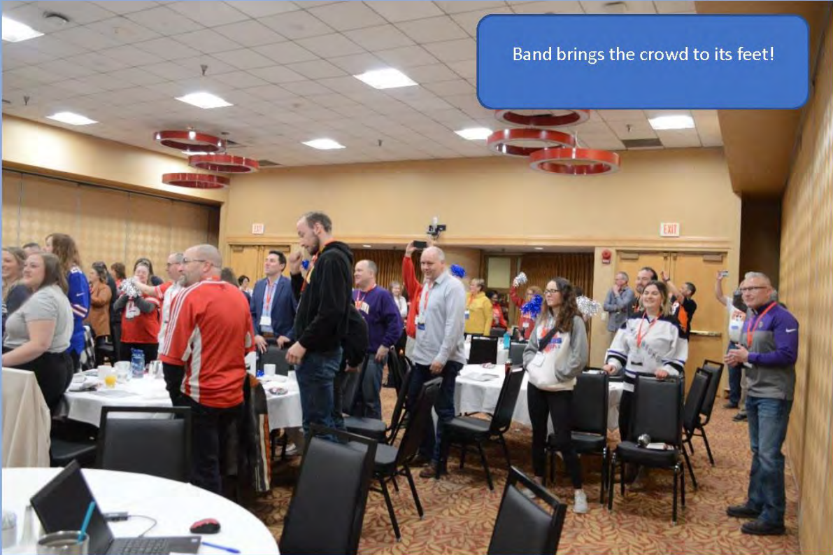
Band brings the crowd to its feet!