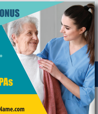
Midwest 2 x 2 Display Sample Ad (3" x 2")

COMPANY NAME 000-000-0000 | CompanyName.com