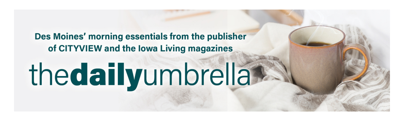
Friday, June 16, 2023