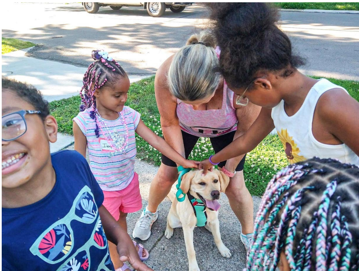
Puppies and kids go together like peanut butter and jelly.