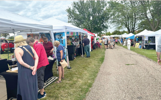
Waukee Arts Festival