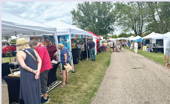
Waukee Arts Festival