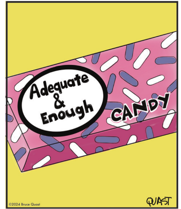
...from the makers of Good & Plenty