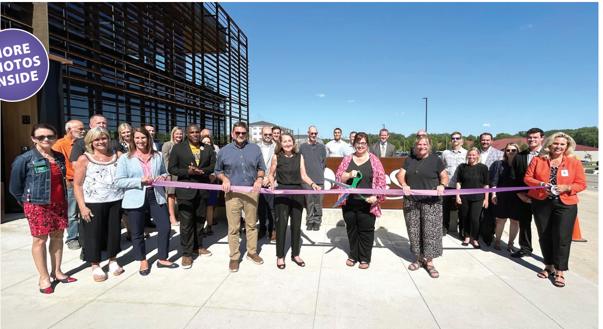
RIBBON CUTTING HELD AT NEW LIFESERVE FACILITY: The Johnston Chamber of Commerce held a ribbon cutting for the new LifeServe Blood Center Johnston Donor Center, 5625 N.W. Johnston Drive, on June 26. The new location serves as the organization's headquarters, a community donation center and a Gift of Life Garden. The 56,569-square-foot building features state-of-the-art design and architecture. Appointments to donate can be made at www.lifeservebloodcenter.org . Hours are Monday and Thursday, 10 a.m. to 6 p.m., Tuesday, 7 a.m. to 3 p.m., Wednesday, 9 a.m. to 5 p.m., Friday, 6:30 a.m. to 3 p.m. and Saturday, 7 a.m. to noon. ■