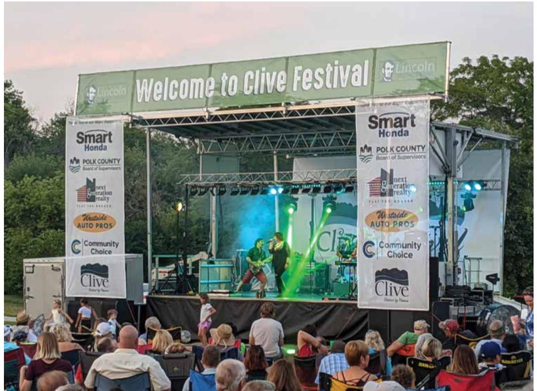
Live music will entertain attendees of Clive Festival.

“We always have a few new wrinkles to the event. There may be a few surprises in the works.”