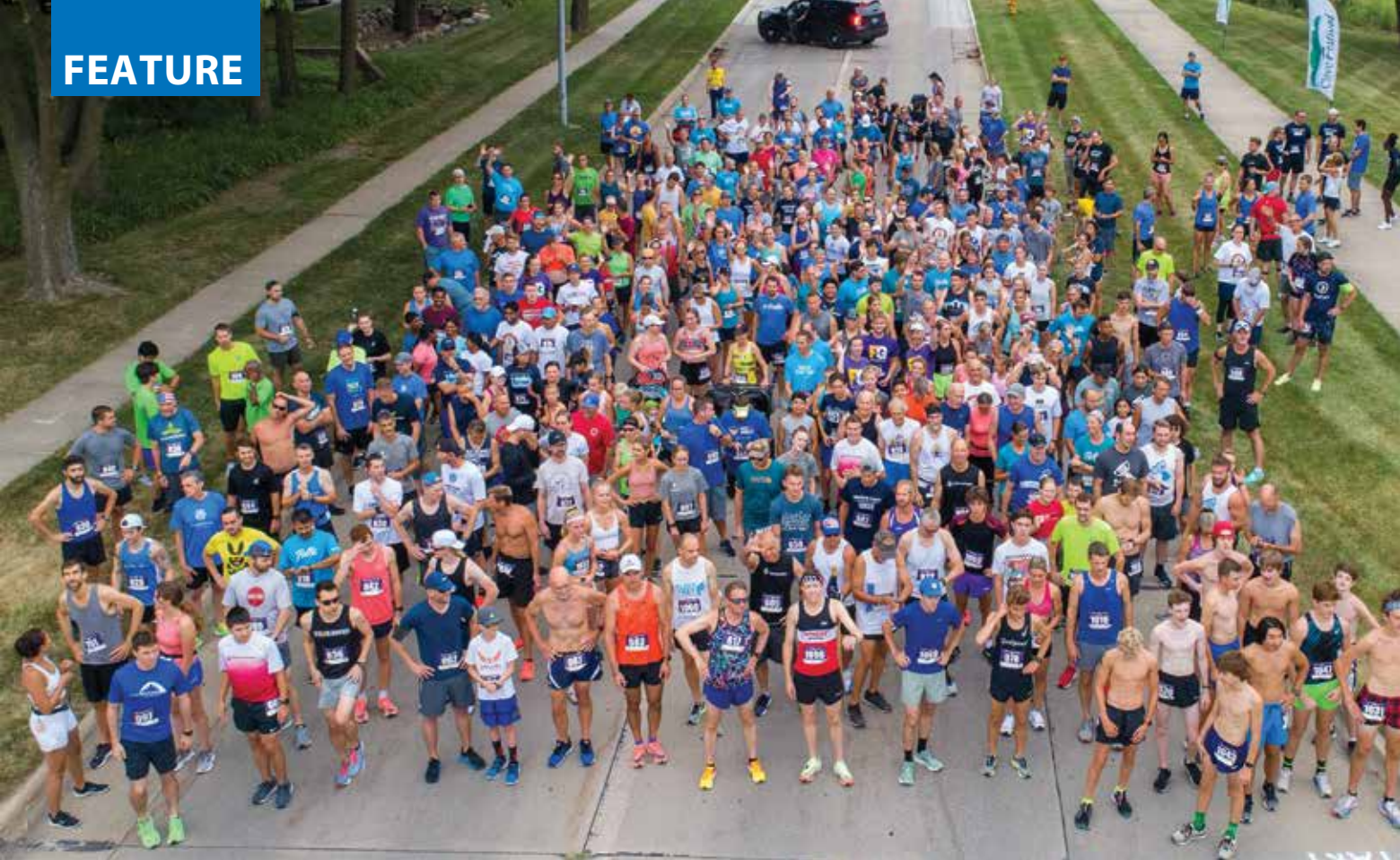
The Clive Running Festival is one of the highlights of Clive Festival.

A particularly popular new event from last year returns.