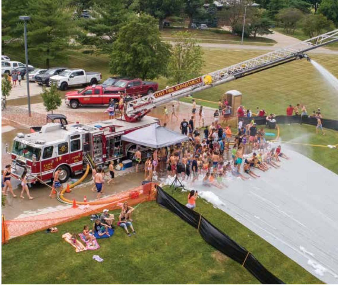
The Fire Department's giant Slip-N-Slide is a summertime favorite.

The event requires many volunteers to make for a successful couple of nights in the heat of late July. Organizers want to thank the volunteers who help put on Clive's largest annual community gathering. Volunteers are still needed, and those interested are encouraged to sign up at www.cityofclive.com/parkandrecreation/programs_and_events/clive_festival.php .