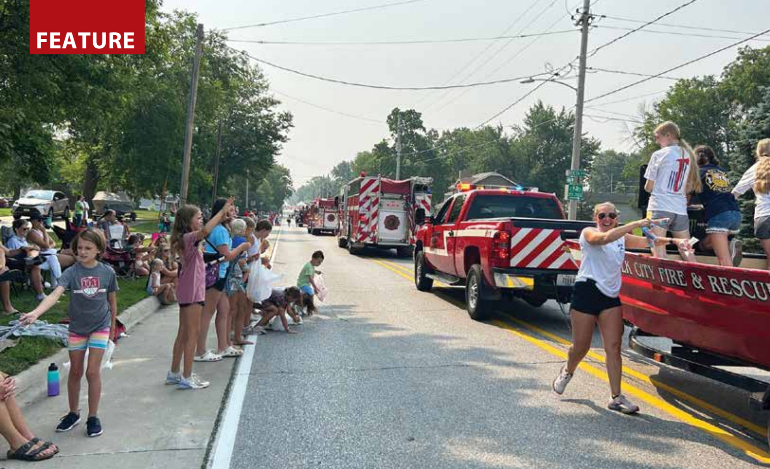
The parade is one of the 4 Seasons Festival highlights.