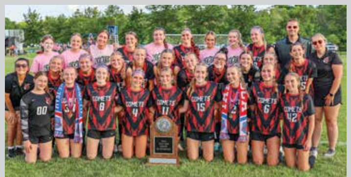
The North Polk girls soccer team was runner-up at the State Soccer Championship on June 1.