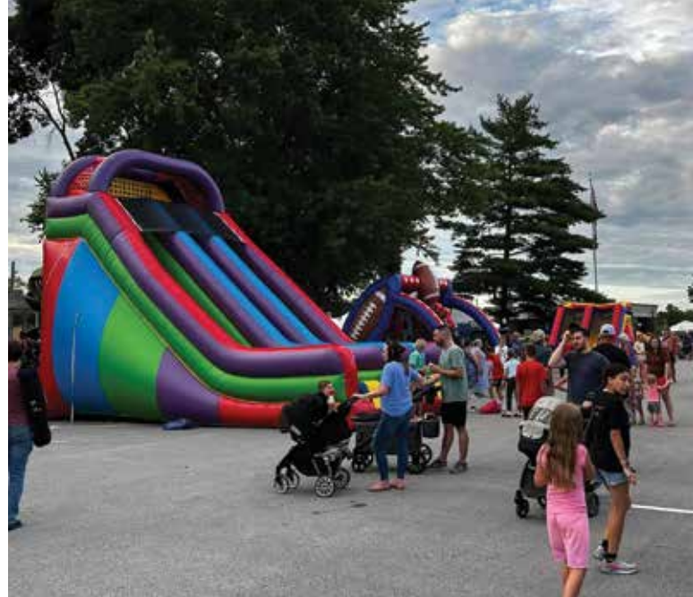
Inflatables and a kids zone provide entertainment for families.

The festival parade kicks off at 10 a.m. and winds through city streets — from Washington Avenue down Broadway Street to the Square — showcasing floats, marching bands and community groups. This colorful