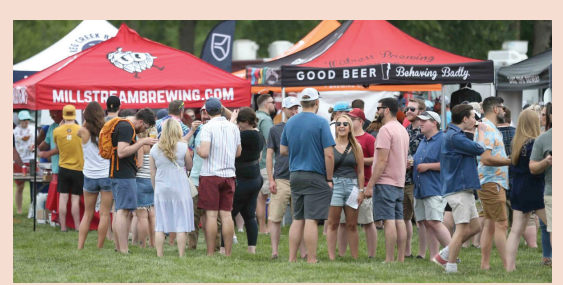
Iowa Craft Brew Festival