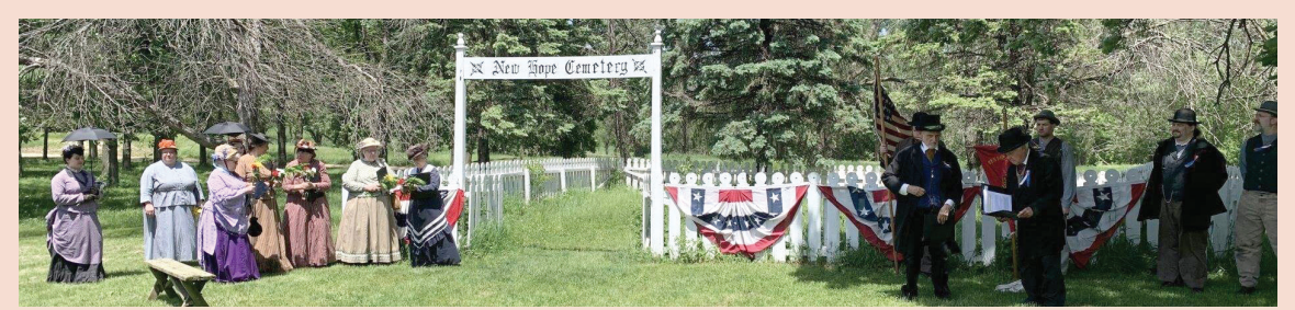
Decoration Day and Historic Baseball at Living History Farms