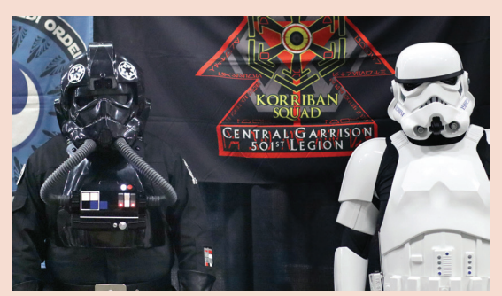
Des Moines Con

This music festival returns to the Horizon Events Center with double-digit musical acts to fill your weekend, starting Friday at 3 p.m. and going till Saturday at 11 p.m. Kids 12 and younger enter for free.