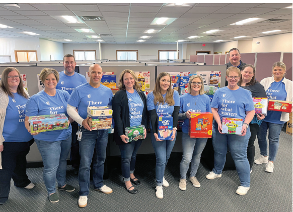
BASE employees help combat hunger with donations of food and money.

BackPack Sacks provide meals to students in grades K-12 that are food insecure on the weekends throughout the school year, while the Kids Summer Food Bags are available to kids weekly throughout