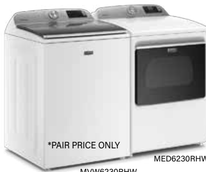
*PAIR PRICE ONLY