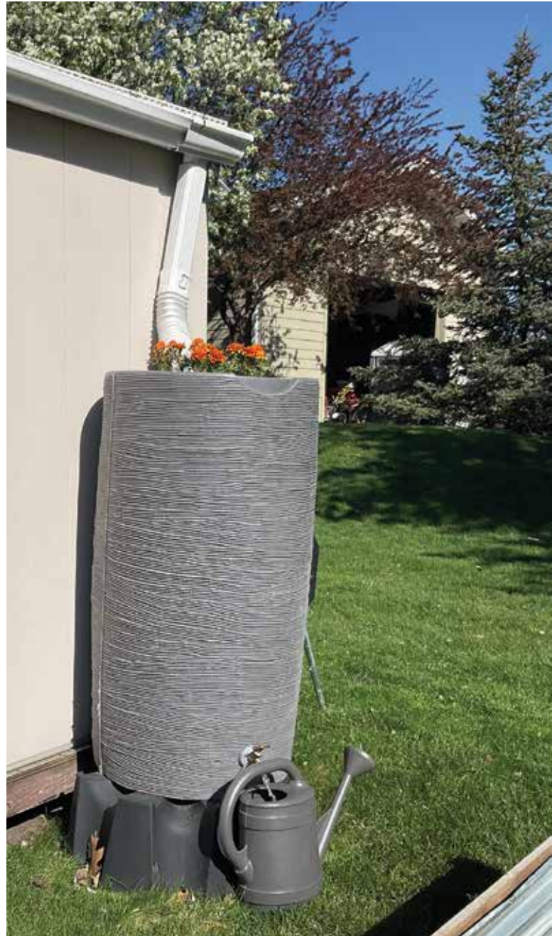
Rain barrels are one tool for preventing water run-off.

"Iowa is one of the most altered states in the nation, and this can impact water quality. Water is one of Iowa's biggest environmental issues. It's not just an agriculture problem. We can all make small changes," she says. "Water quality impacts all of us. It's not an issue that is just going to go away."