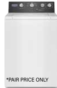
*PAIR PRICE ONLY