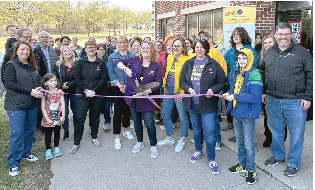
RIBBON CUTTING FOR ANNIE'S FOUNDATION: A ribbon cutting was held March 28 for Annie's Foundation, 5619 N.W. 86th St., Suite 700, Johnston. The Foundation's mission is "to ensure members of our community have unhindered access to books with characters and subjects that reflect the diversity and complexity of the world around them." ■