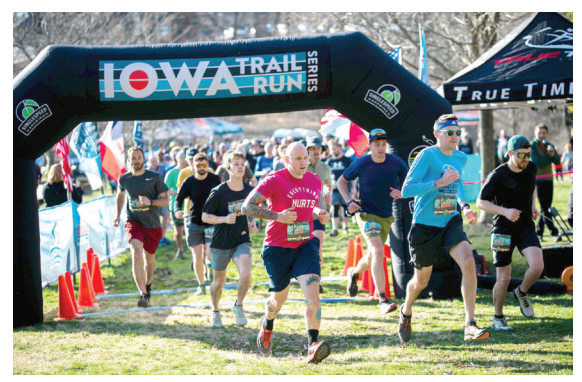
IOWA TRAIL RUN SERIES