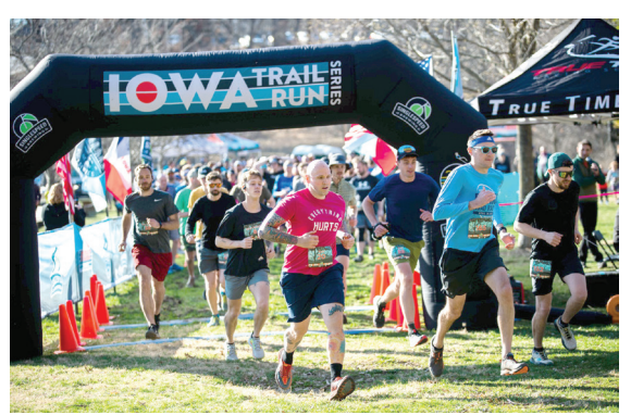
IOWA TRAIL RUN SERIES