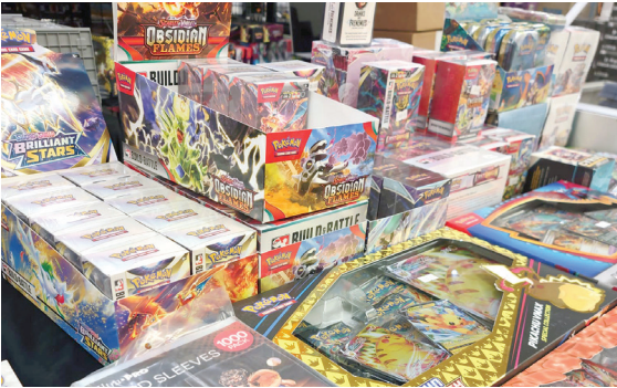
Quadcon Comic and Toy Show is coming to Des Moines.