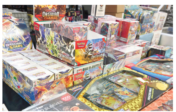
Quadcon Comic and Toy Show is coming to Des Moines.