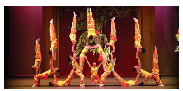
The Peking Acrobats