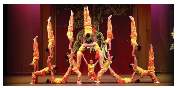
The Peking Acrobats