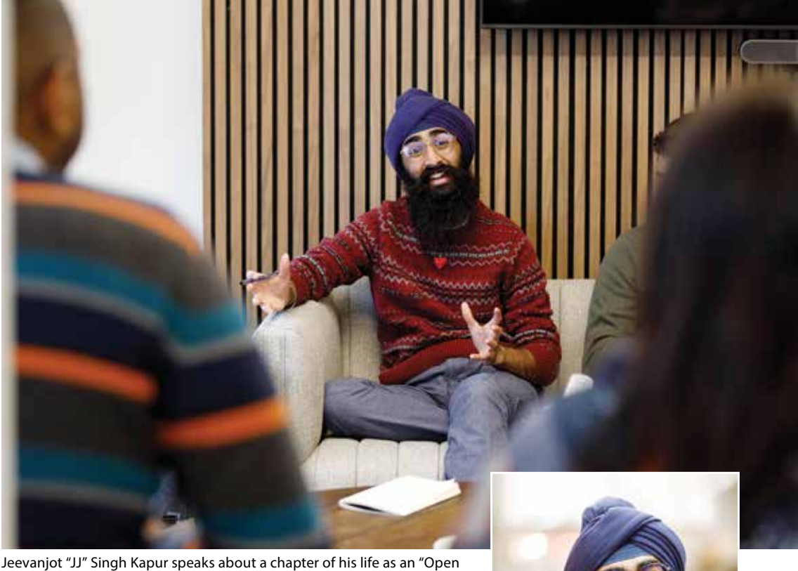
www.iowalivingmagazines.com FEBRUARY | 2024 West Des Moines - Jordan Creek Living magazine 23