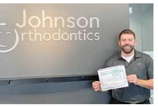
Receiving a certificate for one of Dallas County Residents' Choices for Favorite Orthodontics Office was Johnson Orthodontics.