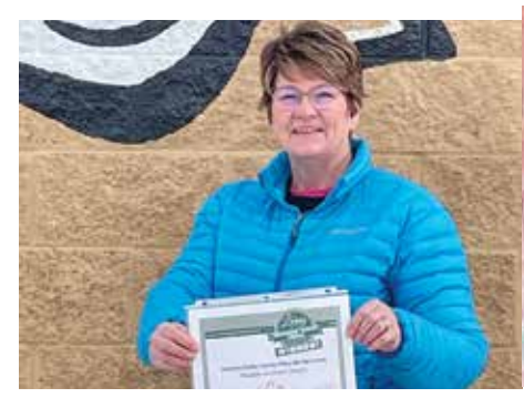
Receiving a certificate for one of Dallas County Residents' Choices for Favorite Place for Ice Cream was Waukee Ice Cream Shoppe.